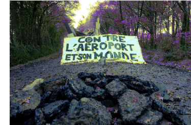
Figure 4: “Against the airport and its world,” NDDL ZAD barricade.

everyday life. This is not to deny the success of a multiplicity of counter-institutional projects or territories, especially as many rightfully refuse easy categorization and remain illegible (notably within Indigenous territories around the world). Experimenting with lived dynamics to go beyond counter-institutions or dual-power remains an open challenge and question to insurrectionary political ecology.