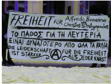
Figure 3: “Freedom for Alfredo Bonanno & Christos Stratiopoulos. The passion for freedom is stronger than any prison.” Both arrested for bank robbery in Greece, Bonanno was age 73 in 2010.

chism is not a concept that can be locked up in a word like a gravestone. It is not a political theory. It is a way of conceiving life” (Bonanno 1998b [1996]: 4), “young or old as we may be, old people or children, it is not something definitive: it is a stake we must play day after day.”