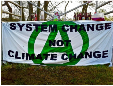
Figure 1: Banner from the inhabited Hambach forest.