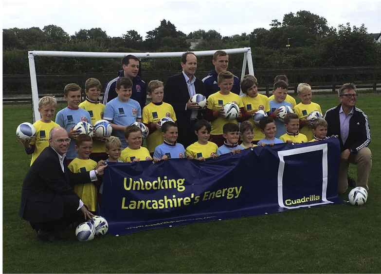
Fig. 3. Cuadrilla's sponsorship (Cuadrilla, 2016).

In terms of community disputes and grievances, are there instances where community leaders or people of influence in the community resolve issues, rather than the local authority or equivalent body?