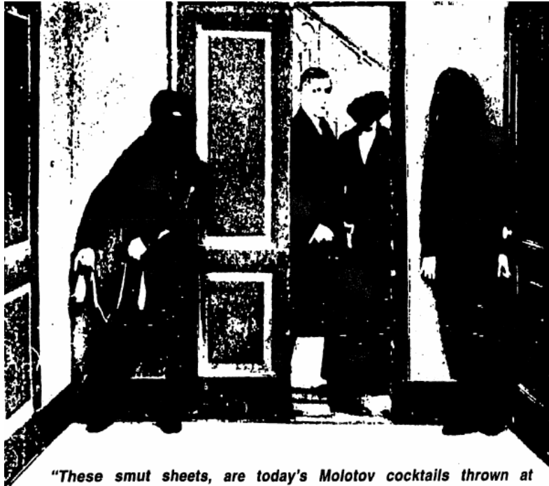
"These smut sheets, are today's Molotov cocktails thrown at respectability and decency in our nation... They encourage depravity and irresponsibility, and they nurture a breakdown in the continued capacity of the government to conduct an orderly and constitutional society." Rep. Joe Pool (House Un-American Activities Committee)