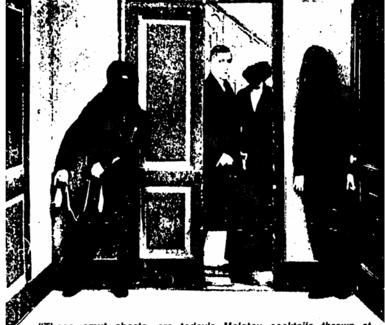
"These smut sheets, are today's Molotov cocktails thrown at respectability and decency in our nation... They encourage depravity and irresponsibility, and they nurture a breakdown in the continued capacity of the government to conduct an orderly and constitutional society." Rep. Joe Pool (House Un-American Activities Committee)

BLACK MASK - whose real axis was still essentially abstract and ethereal: a magazine - dissolved itself and a hard core of some 20 odd people reformed as the Lower East Side SDS chapter(!): UP AGAINST THE WALL MOTHERFUCKER... AND INTO THE TRASHCAN... The first thing they really got their teeth into was the Lower East Side Garbage Strike. As a metaphor the giant rat-infested heaps of rotting garbage were a godsend: now no one could, or would, shift the shit out of sight any more. Not only were they up against the wall they were, quite literally, in the trashcan. From street to street they fired the spread-eagled mounds, drank and danced round them and when the firemen finally arrived (there was a big Firemen's Strike at the same time) climbed on to the tenement roofs (roofs, like sewers, major unpatrolled zones) and lobbed bricks, slates and anything else to hand down on them to cries of 'black-legs'. Unwashed and ragged, dancing, singing,