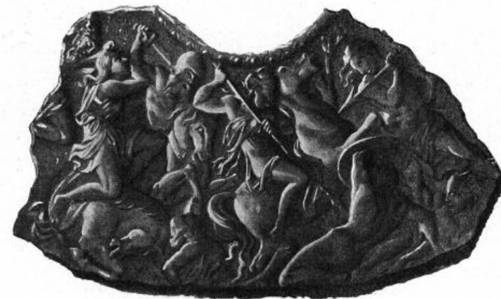
FIGHT OF THE AMAZONS Ancient low-relief. — Fragment of a shield

if they ever existed, as well as to the period of property possessed in common by all beneficiaries of a family group. Even at the time when the horde dragged the whole herd of children with them, the latter naturally had to group behind their genitrix and thus contribute to give her little by little the direction of the family, which happy circumstances developed into social and even political power. The father being unknown, or at least neglected as a being of adventure, the mother gathered around her home those whom she had breastfed and trained for life. Motherhood thus developed in the midst of primitive barbarism and gave the first impetus to future civilization. 7 On the coasts of South America, where family ties are very loose for most men, and where a semi-promiscuity prevails, matriarchy is organized naturally. 8