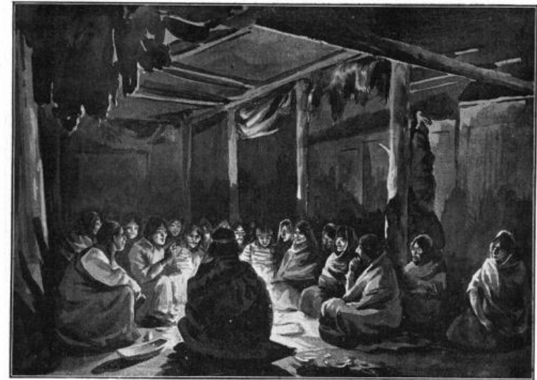
THE GREAT COUNCIL OF WOMEN, AMONG THE WYANDOTS

the Malaca peninsula, the children belong to the mother alone, which is indeed the regime of matriarchy; nevertheless the wife leads a most unhappy existence: the husband beats her and does not allow her to eat in his presence. 15