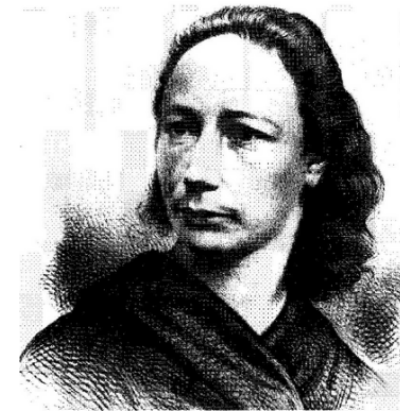
Louise Michel, drawn from life, 1880.

As I was working at the piano that Sunday on the music for the scene of the infernal hunt, someone rang the doorbell. It was