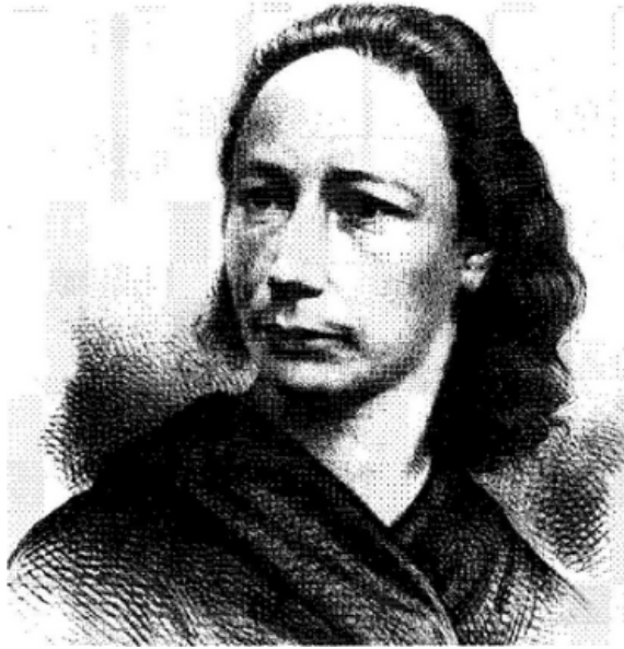
Louise Michel, drawn from life, 1880.