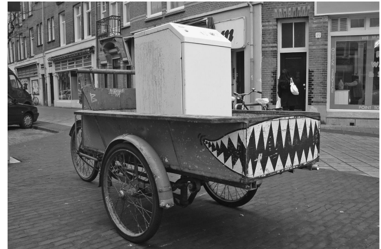
5.1 A utility bicycle built by squatters and used collectively, 2008

Gamson, William A. 1990. The Strategy of Social Protest . 2nd edn. Belmont, CA: Wadsworth.