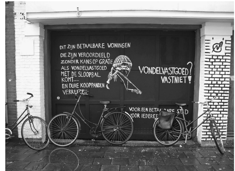
2.3 Pro-squatting graffiti in De Pijp neighborhood, 2006