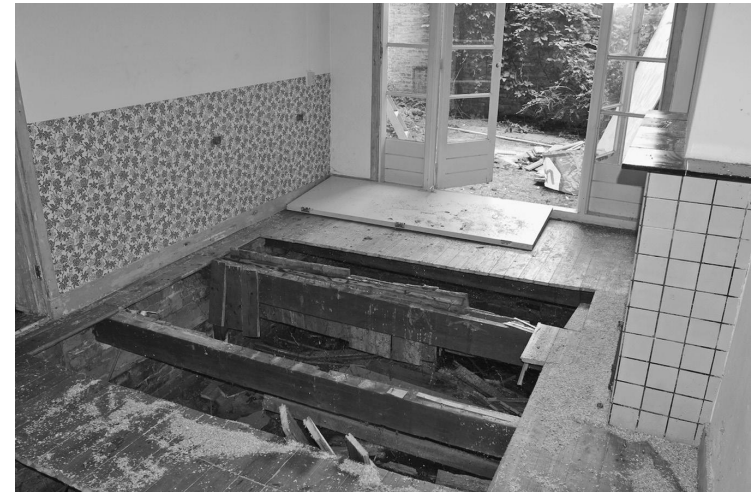
4.2 Interior of a newly squatted apartment that requires rebuilding floors, Amsterdam, 2009

The first squat was really some kind of awakening for me ... I was brought up in a family that was really nice and well-educated, we were never really poor ... it was never really bad. I met some people there who were really, like ... with less opportunities, they didn't have the opportunities to study, they were working in building construction work.