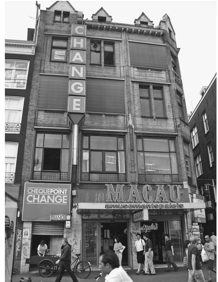
3.4 Building on the Damrak, where ground floor space was in use commercially while upper floors were squatted, 2006