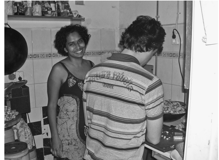
0.3 The author cooking in a squatted restaurant, 2006

According to Graeber, activists who participate in collective action as a revolt against oppression, however, are often people of color and/or immigrants who do so through hierarchical organizations that combat specific discriminations. Thus, the difficulties that these groups have working together derive from wildly divergent underlying motivations. Furthermore, Graeber contends that the racial and class privileges inherent in the lifestyle choices, clothing styles, and consumption practices of self-identified hippies and punks who constitute the antiglobalization movement often offend activists who revolt against racialized and class oppression, since they would never be permitted to engage in practices such as "dumpster diving" or fighting in a black bloc without far more severe and violent