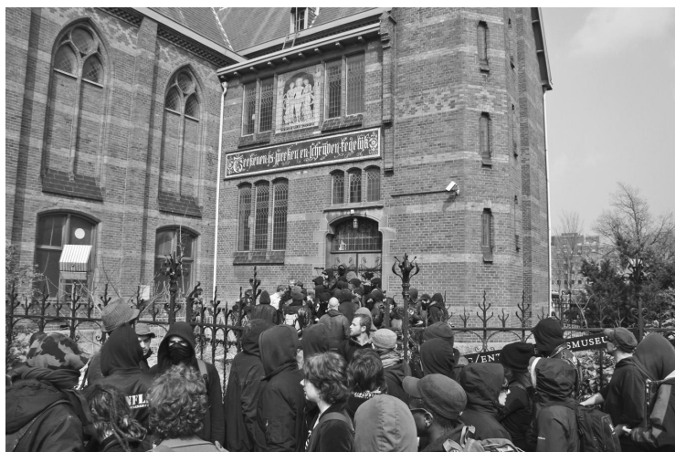
4.1 The squatting of Drawing School, part of the Rijksmuseum, 2008

The owner then hired people to go to the second floor (which was still not squatted) and terrorize the squatters below them on the first floor. The squatters conjectured that the owner hired a number of street thugs, provided them with cocaine, and advised them to wreak havoc in the building. The thugs then pissed onto the floor until their urine went through the ceiling and into the squatters' kitchen below. The thugs made a tremendous amount of noise and threw furniture out the window. Dirk found it an odd situation since the squatters expected a more direct form of attack, in which the thugs would kick in the door and try to beat everyone up. Instead, they succeeded in terrorizing the squatters since the squatters had no idea what was going on and what to expect because the thugs were acting outside the norms for knokploeg (hired thugs) behavior.