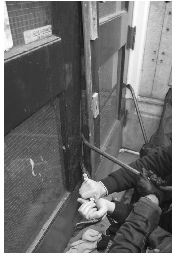
1.1 Breaking open a door during a squatting action, 2008