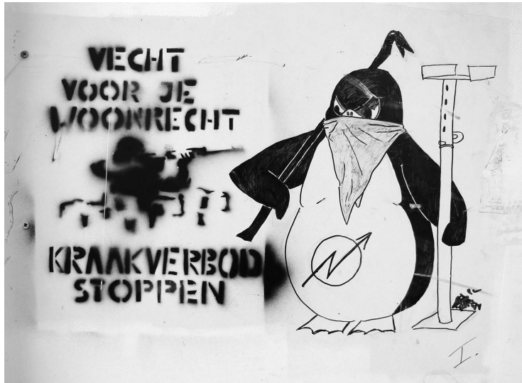
0.2 Graffiti against the squatting ban circa 2006: “Fight for your housing rights. Stop the squatting ban”

to and reify the values of the alternative milieu (Bourdieu and Johnson 1993).