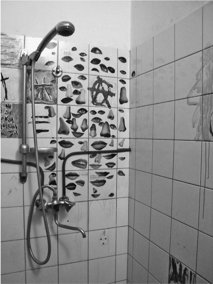
3.1 Shower inside of a squat, 2006

she should have asked for assistance or delegated the task to someone who had the capacity to handle it.