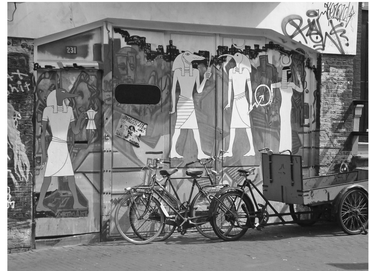
2.1 A squat on the Spuistraat in the center of Amsterdam, 2006

Versus the threat of the white, middle-class, yuppie, the discursive “neighbor” is thoroughly working class and can be either white Dutch or working-class immigrants mainly from Turkey or Morocco. While calling someone a yuppie is an insult and a term of contempt, referring to them as neighbors reflects a relationship of attempted solidarity – whether or not such solidarity exists. Squatters who communicate with the neighbors and work with them together on campaigns receive respect and accrue squatter capital. As in many aspects of squatter capital, this valorization signifies that it is generally unusual for squatters to put energy into creating good relationships with their neighbors.