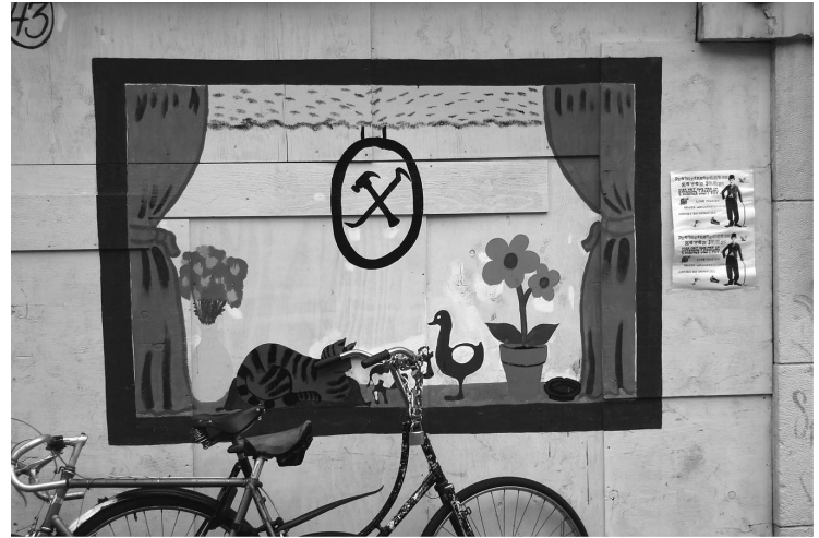
4.3 The painted exterior of a squat, 2008