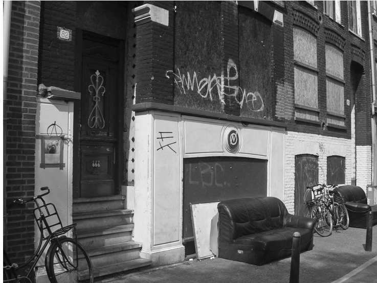
2.2 Squatted building alongside a canal in the Jordaan neighborhood, 2006

twenty page list of things you should live by if you want to rent a room from them. And in my opinion, that's ... I don't find that very honest. Or giving people a bit of freedom. And I think that is a very wrong way to convince people of Christianity.