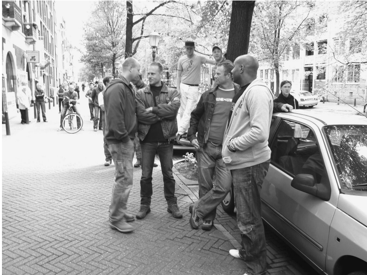
1.4 Plainclothes police officers attempting to look casual prior to a squat's eviction, 2006

random circumstances and the assertiveness of others in the squatting community who intervene, enable the success of action. For example, in the squatters' community where I lived, resided a group of three Eastern European men. None spoke Dutch and could barely speak English. In my experience with them, they were always either drunk or high from a cocktail of drugs that ranged from marijuana (commonplace for squatters) to heroin (taboo). Despite their language handicaps and their addictions, they managed to eke out a living in Amsterdam by playing music and performing on the street for tourists. To squat their flat, they required tremendous assistance from the members of the kraakspreekuur who performed the research, organizational, and communication tasks on the squatters' behalf without being explicitly asked since these men lacked even the capacity to ask for such assistance.