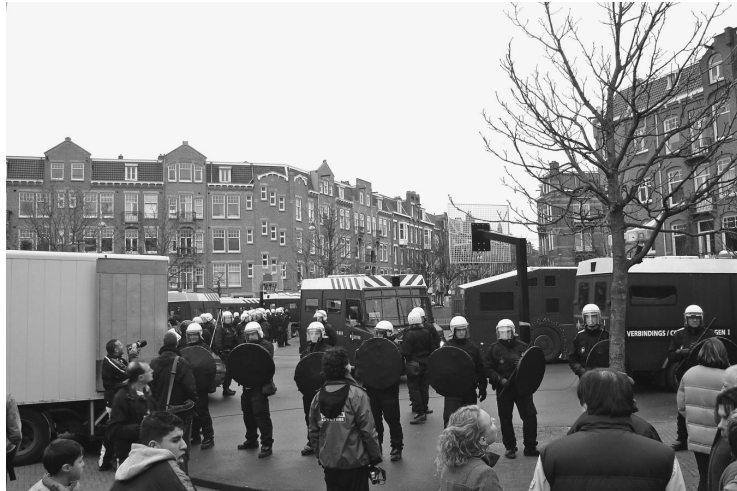
1.3 Eviction of a squat in Amsterdam, 2008

These campaigning tactics are well within the repertoire of squatter campaigning for the past forty years. Talking about the mafia and its use of real estate to money launder and constructing narratives which play on populist Amsterdam sensibilities that hate real estate speculation has proved relatively successful for those who campaign by leading to either the legalization of their squat or being offered low-cost rental housing.