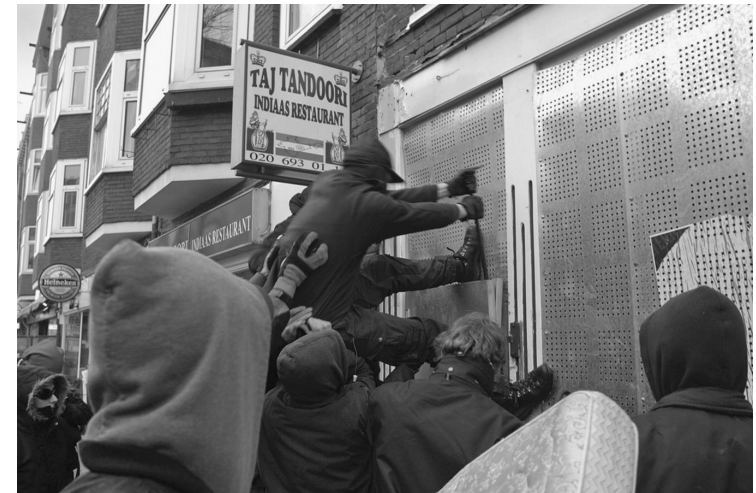
1.2 Breaking open the door during a squatting action

Eviction waves occur approximately three times a year and they constitute the ultimate form of the front stage in the squatters movement because squatters consciously treat these events as performative rituals to communicate with the police, the state, and the imagined Mainstream. The city contracts the riot police to evict all squatted houses with eviction notices on the same day to avoid the costliness of evicting on a more frequent basis. The "riot" between squatters and police is highly institutionalized since it has occurred frequently during the forty years of the movement's history. As a result, the primary performers comprise the squatters and the police, and the audience consists of members of the activist community, random observers, neighborhood residents, and the press, who expect particular types of performances. I base these observations on having witnessed a number of eviction waves and having been evicted by riot police twice, once as part of an eviction wave while the second surprised me and the other fifty people evicted and arrested.