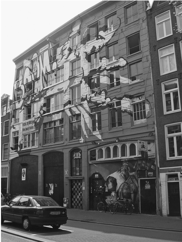
0.1 The Vrankrijk legalized squat, 2006

display the repetition and circularity of this movement over the past forty years. In addition, this background serves to contextualize the interactions between squatters and the front stage of the media, the state, and the press and demonstrate the institutionalization of the squatters movement in urban life. Last, I avoid repeating problematic aspects of the sources used to construct this narrative, such as by extensively describing violent riots and profiling male leaders.