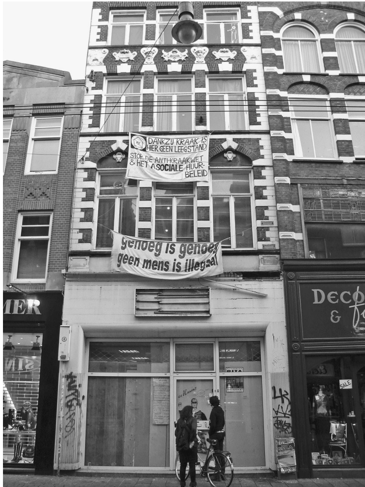
3.2 The “Leidsbezet,” a squatted social center in the center of Amsterdam, 2006