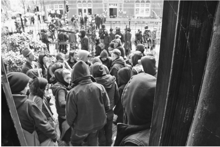
i. Squatting Action Amsterdam, 2008

a Provo idea to create child care facilities collectively run by a revolving group of parents. The local council's endowment of the two buildings to De Straat proved highly controversial to the remaining residents. They demanded that De Straat's projects should derive from collaboration with the neighborhood residents rather than vaguely on their behalf.