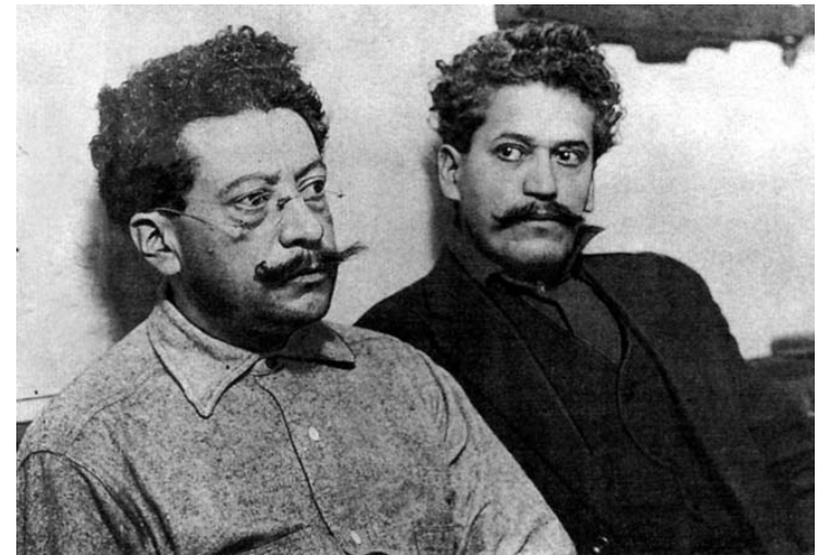
Fig. 8. Ricardo Flores Magón and Enrique Flores Magón, Mexican anarchists, at the Los Angeles County Jail, 1916.