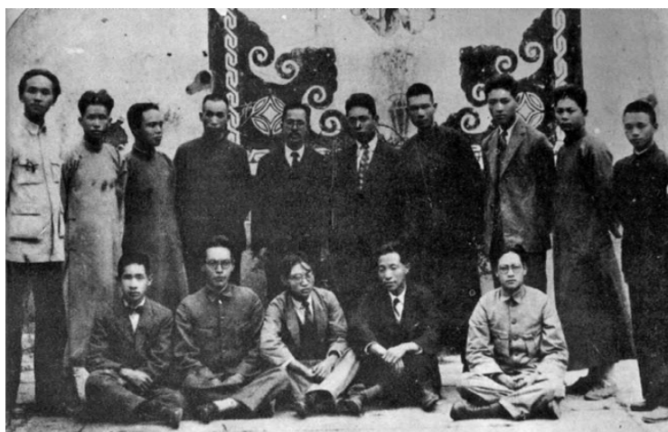
Fig. 2. Members of the Korean Anarchist Federation pose with Chinese comrades involved in a peasant self-management initiative, Pukeun province, China ca. 1927–1928.

Like Cape Town, Durban was defined by “the harbour, the railway and the commerce with the mineral-rich interior”, 135 and developed a significant service and manufacturing sector. The two cities accounted, in fact, for more than half of national manufacturing by the 1920s. 136 From 1905 Durban had the shortest rail link to the Witwatersrand, enabling it to replace Cape Town as the main port. 137 The population by 1910 was 65,000 (around half was white, primarily English-speaking), 138 although the total number doubles if the outlying areas are included. 139 A quarter of the settled population were Indians, mainly descended from indentured labourers, largely low-caste Hindus. While an Indian bourgeoisie emerged, most local Indians were workers, along with small farmers and an educated elite: doctors, interpreters, lawyers, teachers and clerks. 140 Despite the best efforts of officials to whittle down the Indian vote, it was a serious factor in a number of wards in Durban.