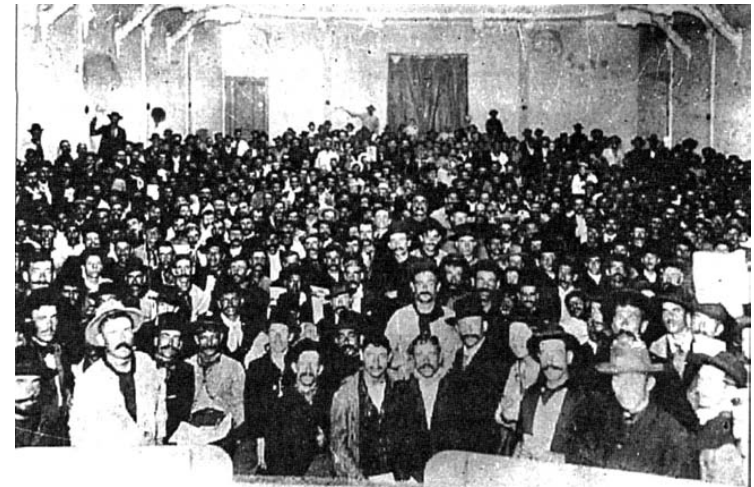
Fig. 9. Maritime workers and dockers affiliated to the Regional Workers Federation of Argentina (FORA) meet in January 1919 on the eve of a general strike.