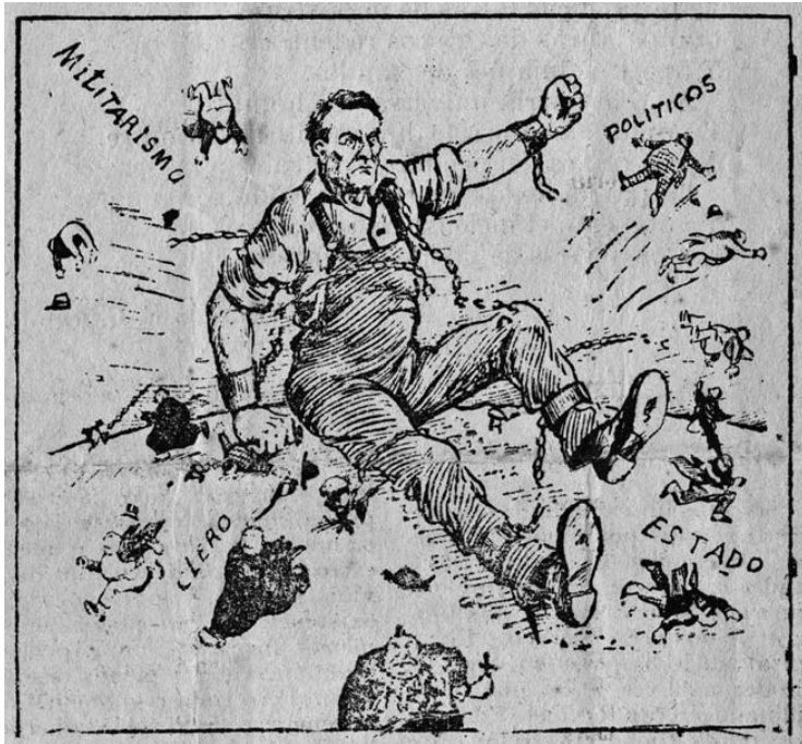
Fig. 7. Peruvian anarcho-syndicalism: breaking the bonds of oppression, exploitation, and ignorance.

Unionist Party called for that very goal. Anarchists challenged the Unionists, asking what would happen if the US flag were actually lowered and the island became independent. Would exploitation of workers end? Would people have enough to eat instead of food being exported? If the answer was 'no,' then independence alone was just political deception of the people. Rather, real independence had to include a restructuring of society based on the egalitarian principles of anarcho-communism with decentralized decision-making and local autonomy from a centralized state bureaucracy. 58