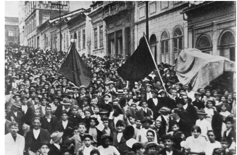
Fig. 10. A crowd scene from the 1917 general strike in São Paulo city, Brazil.