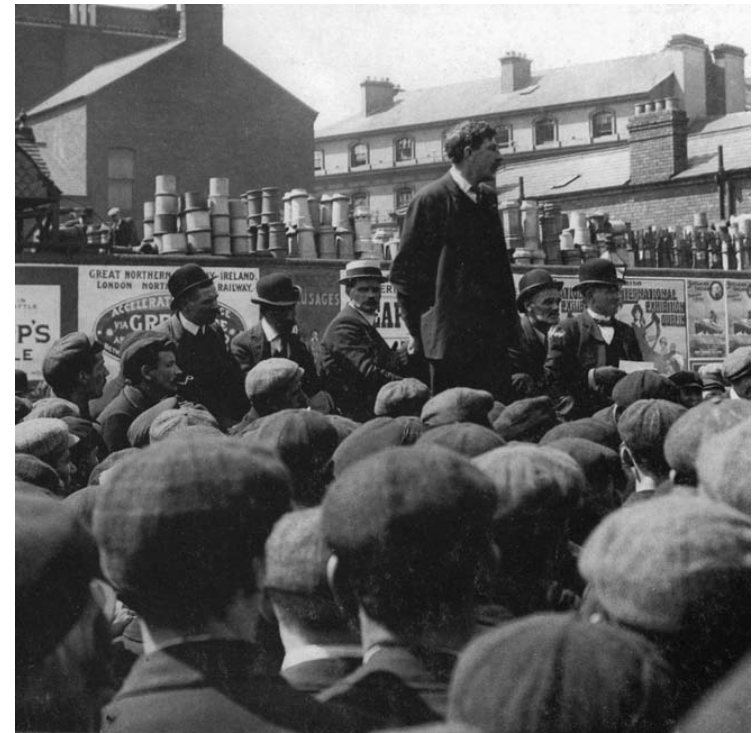
Fig. 5. Jim Larkin speaking in Queen's Square, Belfast, 1907.