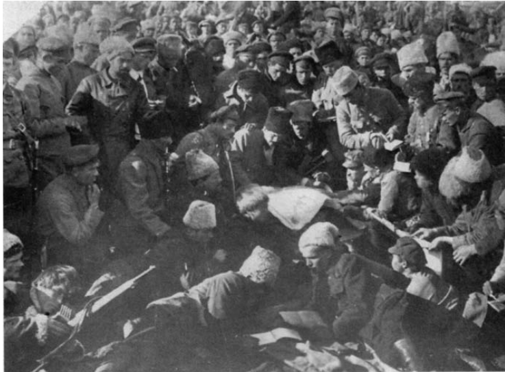
Fig. 4. Makhnovist troops pore over the draft second alliance with the Bolsheviks, Starobelsk, September 1920.

1905– 1910), Humanidad (“Humanity”, 1906–1907), and El Oprimido (“The Oppressed”, 1907–1909).