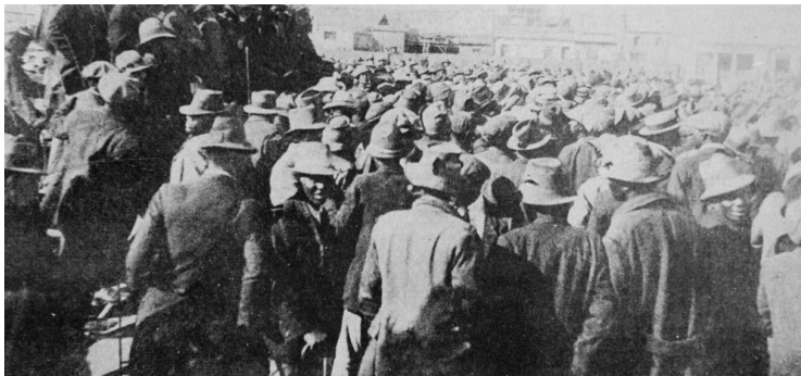
Fig. 1. African workers attend a rally in Johannesburg, addressed by members of the Industrial Workers of Africa, the International Socialist League and the South African Native National Congress, June 1918.

anarchist thought and practice, sometimes in the context of the broader socialist movement. 44 From 1897 al-Jami'a al-Uthmaniyya engaged with socialist ideas while a review, al-Mustaqbal ("The Future"), which appeared in 1914 but was soon closed down by the authorities, featured the work of Salama Musa and Shibli Shumayyil, two Egyptian writers influenced by anarchist ideas. 45