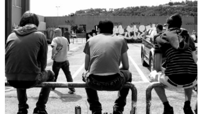
(quote from Invisible Committee in issue of Fire to the Prisons)

"CONTRARY TO WHAT HAS BEEN REPEATED TO US SINCE CHILD-HOOD, INTELLIGENCE DOESN'T MEAN KNOW-ING HOW TO ADAPT; OR IF THAT IS A KIND OF INTELLIGENCE, IT'S THE INTELLIGENCE OF SLAVES."