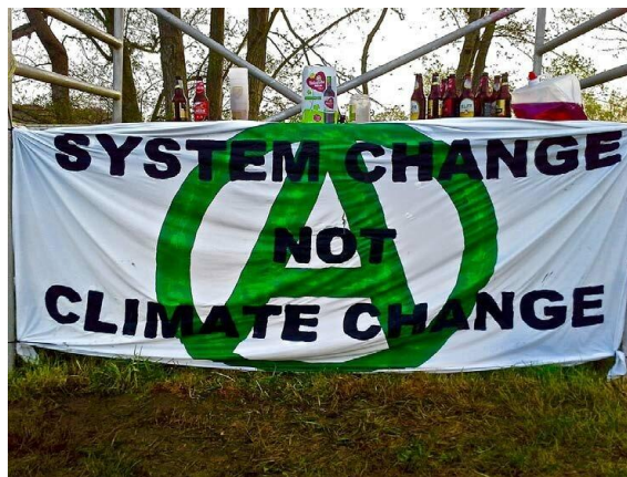
Figure 1: Banner from the inhabited Hambach forest.

The next sections situate a political ecology of resistance. Following this, the concepts of “do nothing” natural farming and insurrectionary anarchism are explored, through an analysis of Masanobu Fukuoka’s (2010 [1978]) The One Straw Revolution and various insurrectionary anarchists texts, such as the Anonymous (2001 [1998]) booklet: At Daggers Drawn: with the existent, its defenders, and its false critics . The two concepts come into dialogue with each other in the subsequent section, discussing their philosophical commonalities and differences. Considering the sensitive, difficult and—for many— “impossible” relational direction advocated by natural farming and insurrectionary anarchism, the conversation focuses on the challenges faced by insurrectionary political ecology within the current institutional and political context. The article concludes by reviewing insurrectionary political ecology and by offering ways to move forward as a discipline. The graffiti sprayed on the walls of Paris during the May 1968 insurrection: Be realistic – demand the impossible (!) , should not only guide the reading of this text, but also the ways we imagine and work towards an alternative present and future. As Ward Churchill (2003: 272) reminded us: “you must never allow your oppressor to define what’s “realistic” for you. Imaginations, capabilities and ideas should not be constrained by “practicalities” or “realism”, even if their confrontation is inevitable.