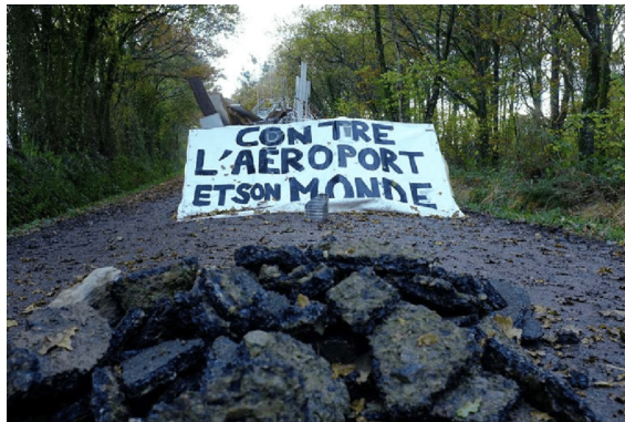
Figure 4: “Against the airport and its world,” NDDL ZAD barricade.

into political structures. Insurrectionary anarchism rejects the erection of bureaucracies with (informal or formal) political candidates, and the reproduction of political structures that mimic the existing colonial/statist organizational structures. In the Zone to Defend (ZAD) struggle against the airport in Notre-Dame-des-Landes in France, there were ontological disagreements over political structures and collaboration with state officials (see Crimethinc 2019). These produced discord, relational failures and impasses that demanded critical self-reflection. Counter-institutions like these movements tend towards hierarchical dynamics that risk extending the bureaucracy of everyday life. This is not to deny the success of a multiplicity of counter-institutional projects or territories, especially as many rightfully refuse easy categorization and remain illegible (notably within Indigenous territories around the world). Experimenting with lived dynamics to go beyond counter-institutions or dual-power remains an open challenge and question to insurrectionary political ecology.