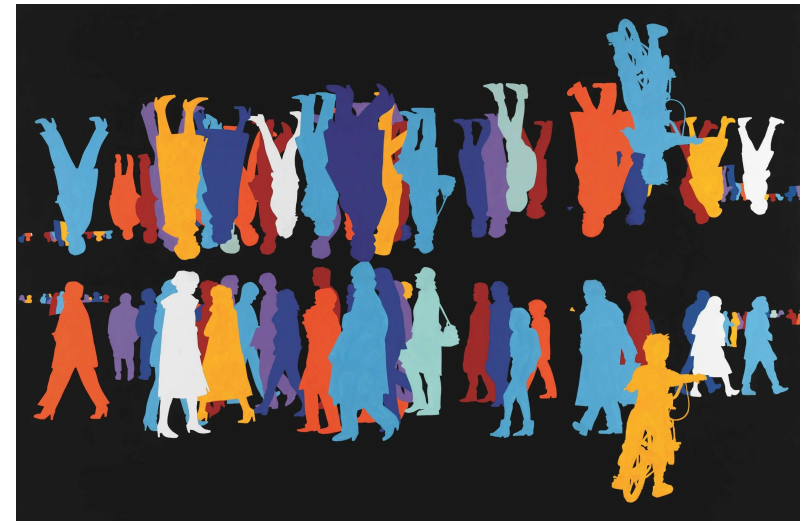
Art by Gerard Fromanger