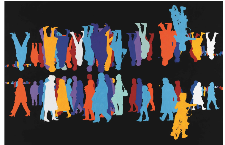
Art by Gerard Fromanger