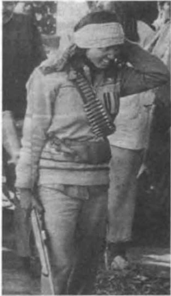
The answer to male egos? Throughout the 1980's India's Bandit Queen, Phoolan Devi, led thousands in a war against patriarchy & the caste system.

a run. Yet if one male does it one night you can guarantee the ritualistic argument that will follow during the course of the evening where each testosterone filled being will slam their cards down on the table, and tell every member of the camp and any lurking SAS in more than graphic detail exactly what they had done that day. how they did it, and what techniques they used to tie that particularly complex walkway knot. In most situations it is the description of the knot that gets everyone going, because someone else always knows better and that someone else that knows better, you can bet your harness on it. will invariably be male . A friend of mine said something which summed the situation up very nicely: “The ways some blokes carry on, you’d think it was a fucking achievement managing to have a shit in the shit pit”—and that was said by a man!