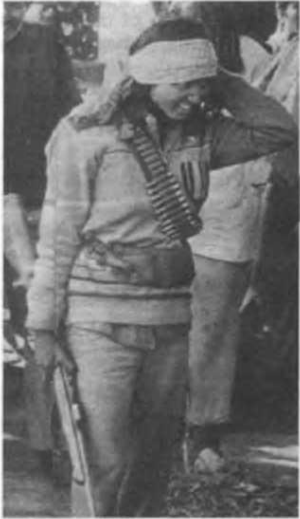
The answer to male egos? Throughout the 1980's India's Bandit Queen, Phoolan Devi, led thousands in a war against patriarchy & the caste system.

bubbling, and not even whisper that she is pissed off with doing it for the tenth night on a run. Yet if one male does it one night you can guarantee the ritualistic argument that will follow during the course of the evening where each testosterone filled being will slam their cards down on the table, and tell every member of the camp and any lurking SAS in more than graphic detail exactly what they had done that day. how they did it, and what techniques they used to tie that particularly complex walkway knot. In most situations it is the description of the knot that gets everyone going, because someone else always knows better and that someone else that knows better, you can bet your harness on it. will invariably be male . A friend of mine said something which summed the situation up very nicely: “The ways some blokes carry on, you’d think it was a fucking achievement managing to have a shit in the shit pit”—and that was said by a man!