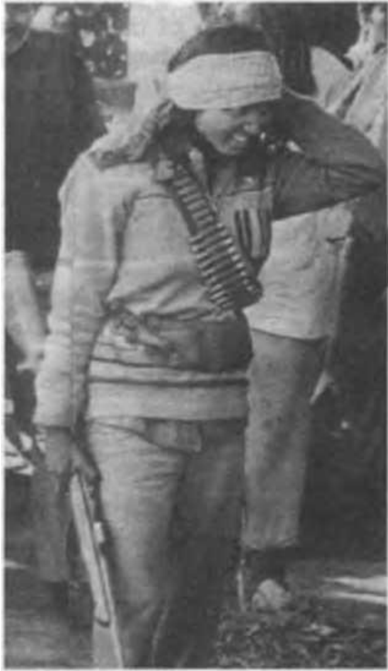
The answer to male egos? Throughout the 1980's India's Bandit Queen, Phoolan Devi, led thousands in a war against patriarchy & the caste system.