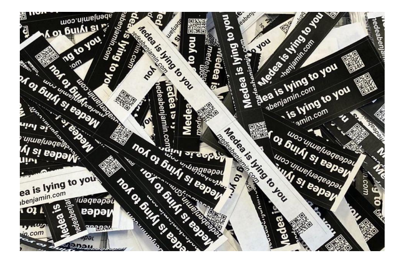
Now, imagine 500 of these and a lot of larger pieces of paper.

The day after Medea's WAMM and VFP event, she was hosted by May Day Books, a local authoritarian leftist bookstore in Minneapolis' Cedar-Riverside neighborhood. We understand the attendees of the Mayday Event were nearly all the same people as the one the night before. May Day is an interesting target because it has the distinction of being in the basement of a fairly ramshackle building with only one known entrance and exit. Comrades took it upon themselves to create approximately 500 double sided strips of paper with a simple message: "Medea Benjamin is lying to you." Each small strip included a link to https://medeabenjamin.com with a QR code. May Day's stairwell can be accessed numerous ways and in the initial pass of the building, "Security" ie., one of the people responsible for starting the scuffle the night before, was standing nearby. Happily enough, he was "guarding" the route that would be taken by someone doing what our comrades planned to do if they had no knowledge of the local area or had not performed the most cursory tactical terrain analysis.