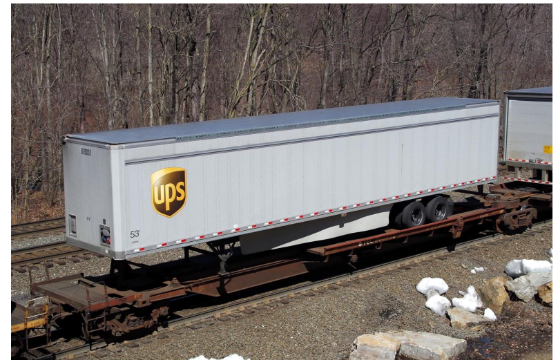
IM car with UPS pig with wings.