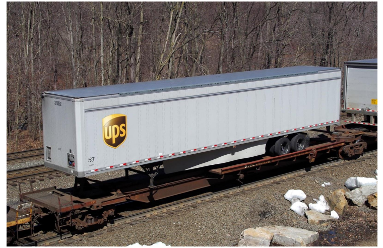
IM car with UPS pig with wings.