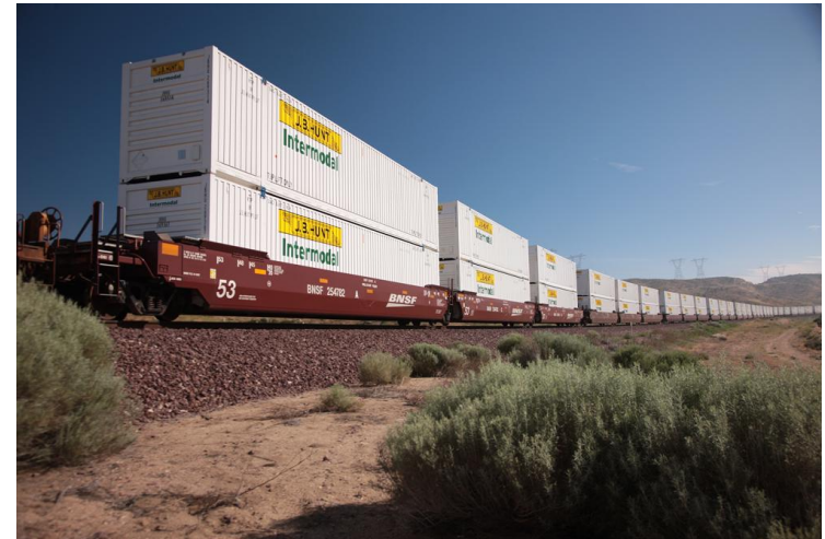
53 ft smooth cars from an IM with JB Hunt double stack cans.