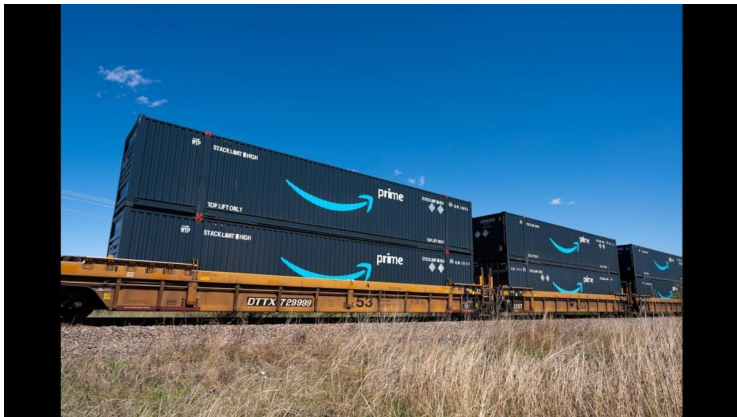
53 ft ribbed car from an IM with Amazon Prime double stack cans.