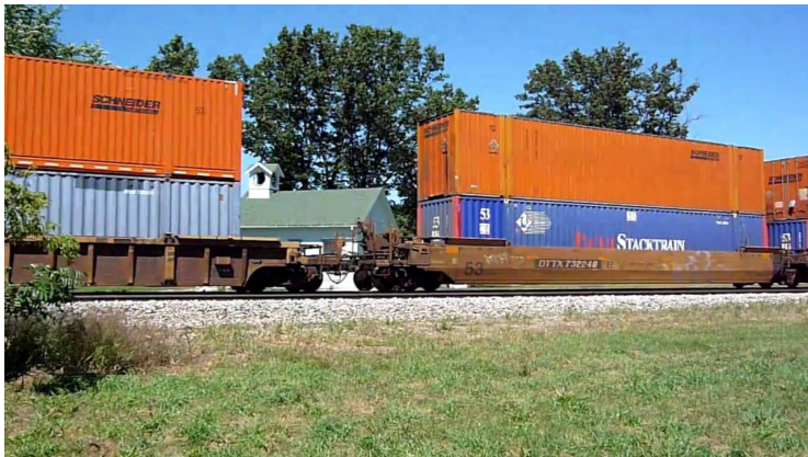
Two 53 ft double stack IM cars. Ribbed car on the left much more likely to be rideable than smooth car on the right.

cargo, or refueling. The crew change guide should specify the crew change spots and might specify whether work/refueling is done.