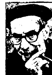
THE OLD MARX

A party? You call this a party? The beer is warm, the women are cold, and I'm hot under the collar!