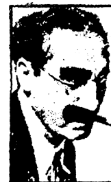
“THE YOUNG MARX”

TRULY, MARX HAS ALL THE ANSWERS. IF ONLY WE KNEW THE QUESTIONS!