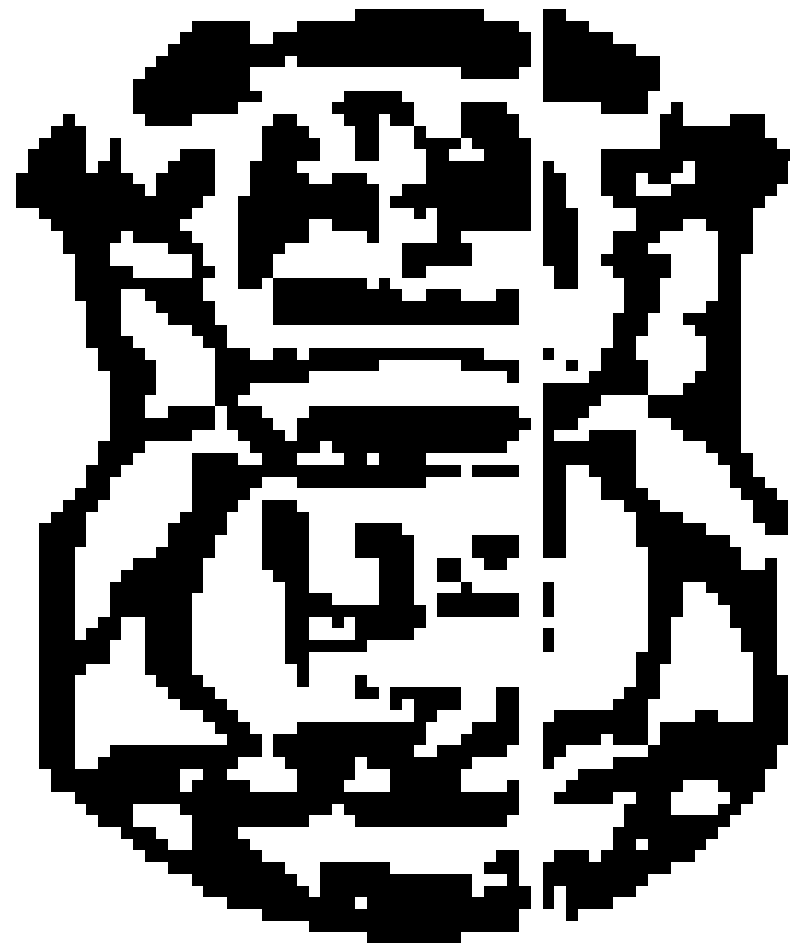
G. MENNEN WILLIAMS Governor