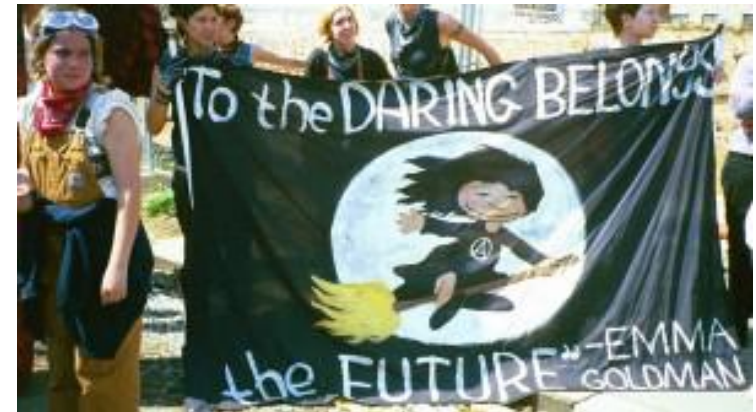
Anarcha-feminists at an anti-globalization rally and protest quote Emma Goldman

But even more striking is the conceptual convergence with the conception of freedom that I have described above. For instance, Kornegger affirms that "liberation is not an insular experience" because it can occur only in conjunction with all other human beings (ibid., 496), which, again, means that freedom cannot but be a freedom of equals. However, this also implies that one cannot fight patriarchy without fighting all other forms of hierarchy, be they economic or political. As Kornegger (2007:493) again put it, "feminism does not mean female corporate power or a woman president: it means no corporate power and no president."