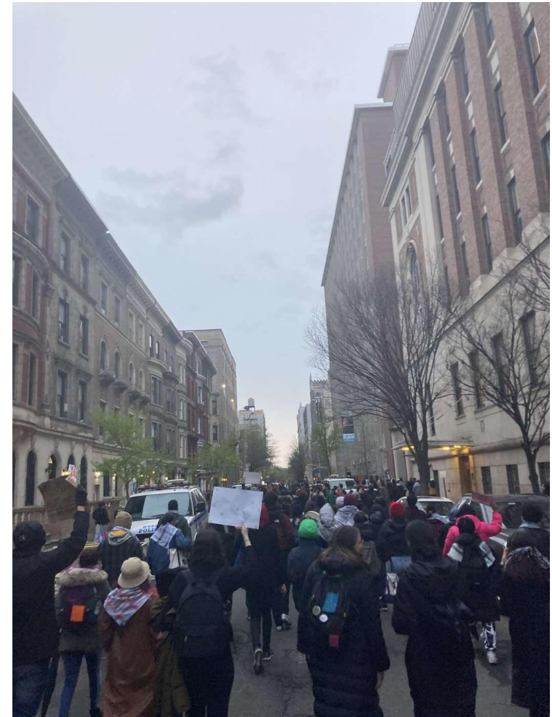
A march outside Columbia campus.

The bold decision to occupy the West Lawn exemplifies this. It was significant, first, because holding physical space has proved to be a critical element in focusing the energy and attention of the movement on campus. Countless demonstrations have taken place at Columbia since October, but however energetic and well-attended they were, all of them dispersed within a few hours, conceding both the physical territory and the initiative to the administration, which ratcheted up repression by targeting the participants after the fact. By contrast, holding territory has compelled all sides to confront the fact of the ongoing genocide; it has drawn many more people into the movement, creating a new cross-pollination between campus life and protest activity. To the extent to which the administration cannot distinguish between the student body as a whole and the protesters, everyone involved is safer.