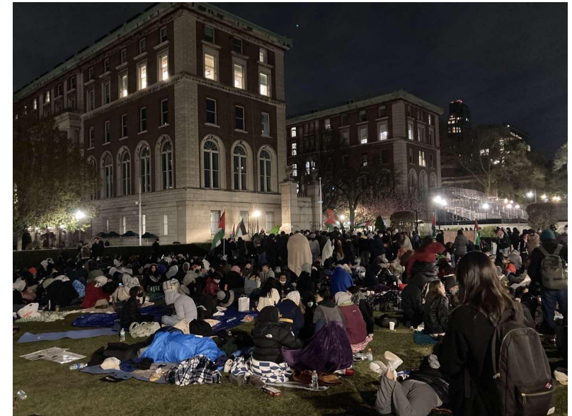
The encampment on the night following April 18.