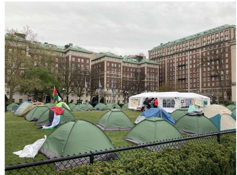
The East Lawn on Columbia University campus on Wednesday, April 17.

In the end, the size and spirit of the camp proved too much to evict that night. At 10:44 pm, organizers got word that the administration had been forced to abandon plans for a sweep. The camp survived the night.