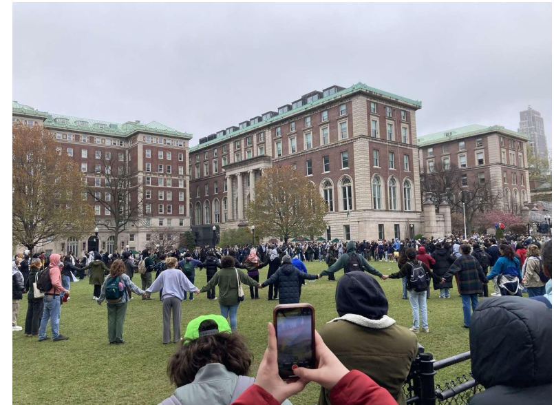
The occupation of the West Lawn unfolds.

Similarly, after arresting the participants, police and university staff carefully went through all of the tents one by one, disassembling them, placing them and the strewn belongings in plastic bags, and loading them into a truck; they have since sent messages confirming that a process is in the works to return students' confiscated property. Compare this with the way NYPD officers treat the