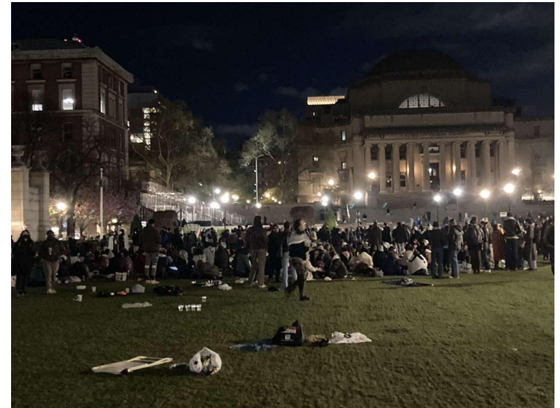
The encampment on the night of April 18.