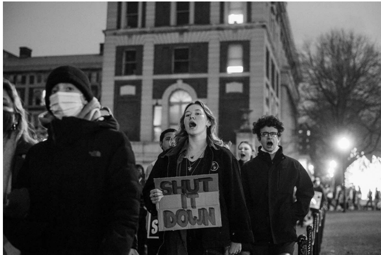
Participants in Columbia's graduate worker union demonstrating during the previous round of protest activity at Columbia.

The groups that joined the coalition reflected a wide range of political perspectives and ethnic and religious backgrounds, tapping into a diverse range of the campus's social networks. These would be instrumental in the struggle to come.