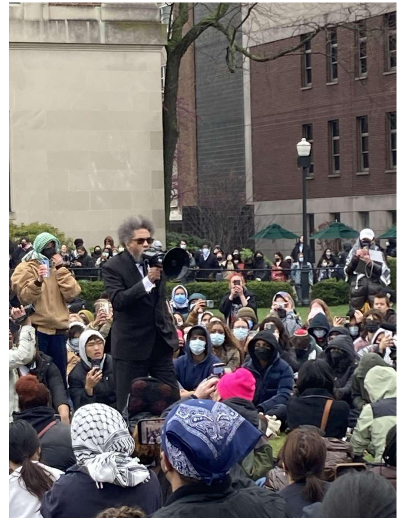
Cornell West speaking on the West Lawn.

Camera-hungry vultures, I grumble, but these sightings really do seem to generate excitement and boost morale.