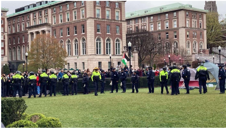
Police seizing the East Lawn on Thursday, April 18.

short blocks by one long block; the perimeter is comprised of walls and iron gates. An archway over Amsterdam Avenue connects to additional campus buildings and the law school in another linked area of two square blocks. Barnard College, Columbia's sibling institution on the other side of Broadway, is similarly compact, forming a rectangle one block long by four blocks wide, fenced in with even fewer entrances and exits, though those with Columbia and Barnard IDs can freely enter either campus.