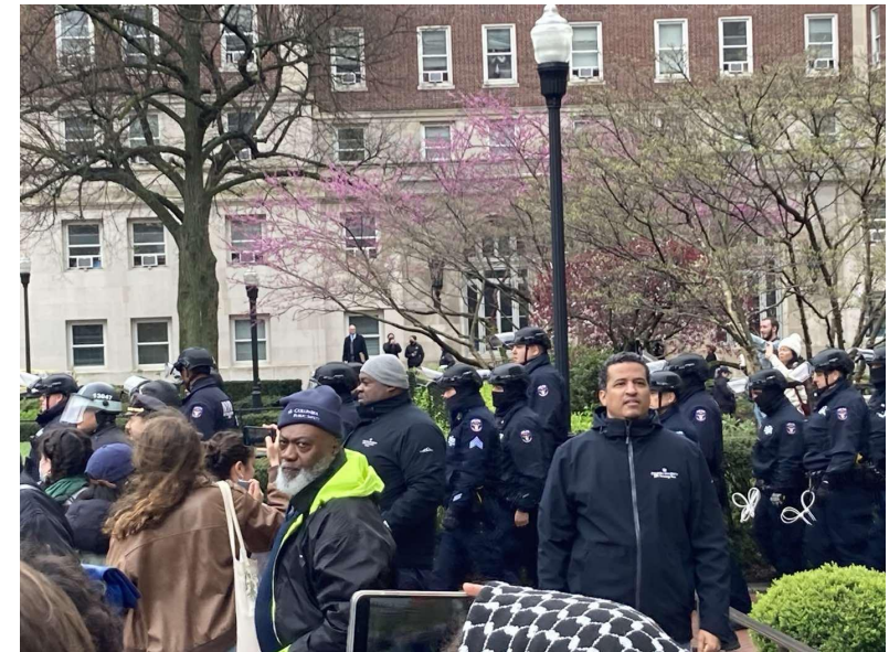
Police enter Columbia campus on Thursday, April 18.

the lawn, blocked off any exit, and began blaring an order to disperse on threat of arrest for trespassing.