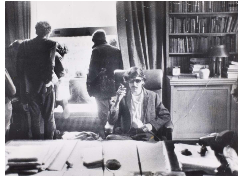
A student activist occupying the office of the president of Columbia University, smoking one of his cigars, during a six-day campus uprising and strike in 1968.

This is why the most important boundary to overcome is the distinction between inside and outside . As long as a strict separation remains between students and non-students, between included and excluded , those who wish to act in protest will have to choose between a venue in which any action will be seen as possessing social legitimacy but must be undertaken by highly surveilled students who consider themselves to have a lot to lose, and a space outside the walls where more forms of action are possible but less is at stake in terms of perceived legitimacy and the power to disrupt. The solution is to tear down the walls.