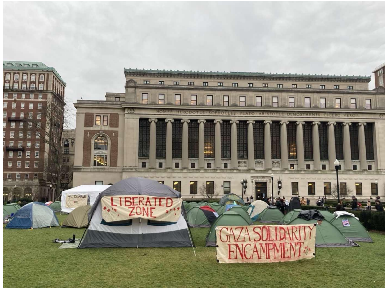
The East Lawn on Columbia University campus on Wednesday, April 17.