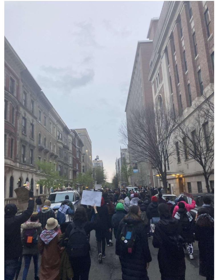
A march outside Columbia campus.

The bold decision to occupy the West Lawn exemplifies this. It was significant, first, because holding physical space has proved to be a critical element in focusing the energy and attention of the movement on campus. Countless demonstrations have taken place at Columbia since October, but however energetic and well-attended they were, all of them dispersed within a few hours, conceding both the physical territory and the initiative to the administration, which ratcheted up repression by targeting the participants after the fact. By contrast, holding territory has compelled all sides to confront the fact of the ongoing genocide; it has drawn many more