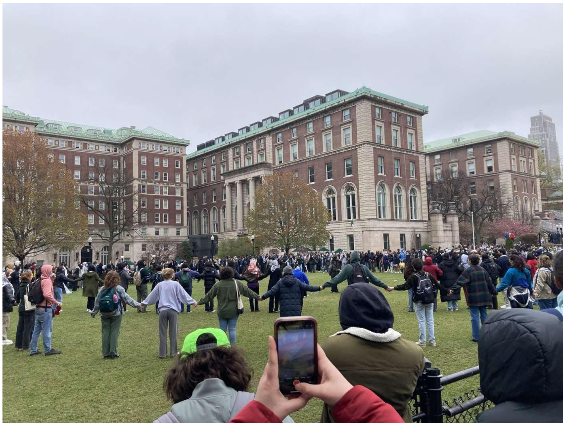
The occupation of the West Lawn unfolds.

The bold decision to occupy the West Lawn exemplifies this. It was significant, first, because holding physical space has proved to be a critical element in focusing the energy and attention of the movement on campus. Countless demonstrations have taken place at Columbia since October, but however energetic and well-attended they were, all of them dispersed within a few hours, conceding both the physical territory and the initiative to the administration, which ratcheted up repression by targeting the participants after the fact. By contrast, holding territory has compelled all sides to confront the fact of the ongoing genocide; it has drawn many more people into the movement, creating a new cross-pollination between campus life and protest activity. To the extent to which the administration cannot distinguish between the student body as a whole and the protesters, everyone involved is safer.