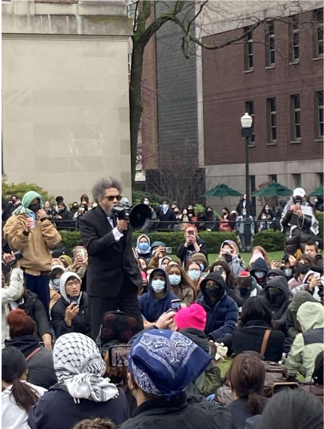
Cornell West speaking on the West Lawn.