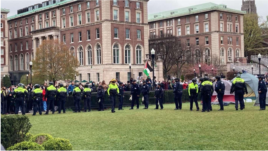
Police seizing the East Lawn on Thursday, April 18.

Beginning last fall, after large and contentious pro-Palestine demonstrations and Zionist counter-demonstrations took place on campus, the university began selectively restricting access to campus by locking nearly all the access gates and requiring people to swipe an active ID card at a reader staffed by private security guards. This has been an immensely unpopular move across the board, on account of both the inconvenience it creates and the Orwellian police state vibe it imposes.