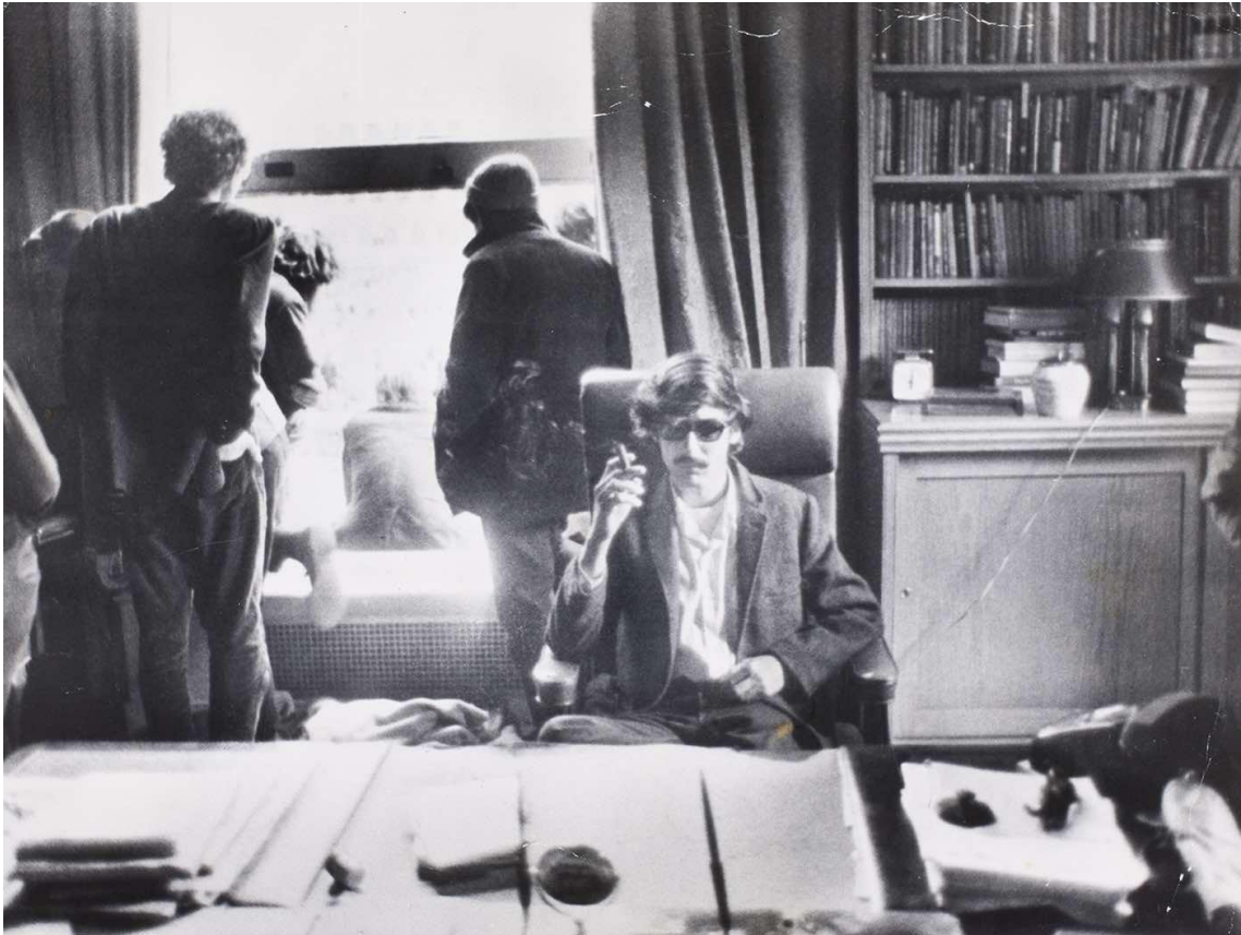
A student activist occupying the office of the president of Columbia University, smoking one of his cigars, during a six-day campus uprising and strike in 1968.

You can read a full history of the 1968 occupation of Columbia here .