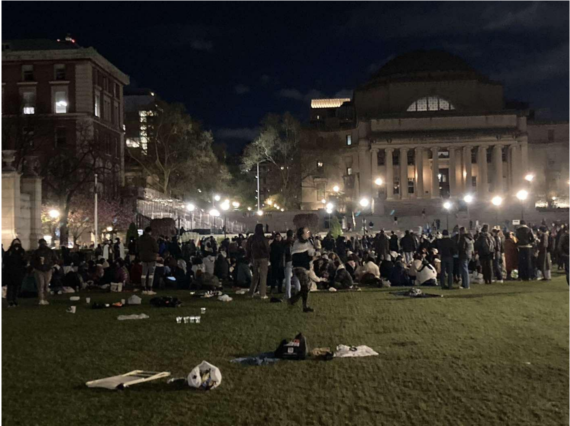
The encampment on the night of April 18.