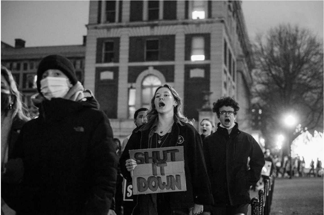
Participants in Columbia's graduate worker union demonstrating during the previous round of protest activity at Columbia.