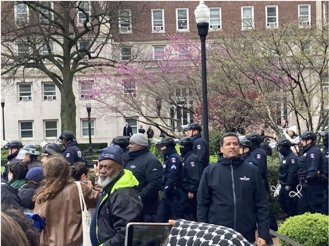
Police enter Columbia campus on Thursday, April 18.