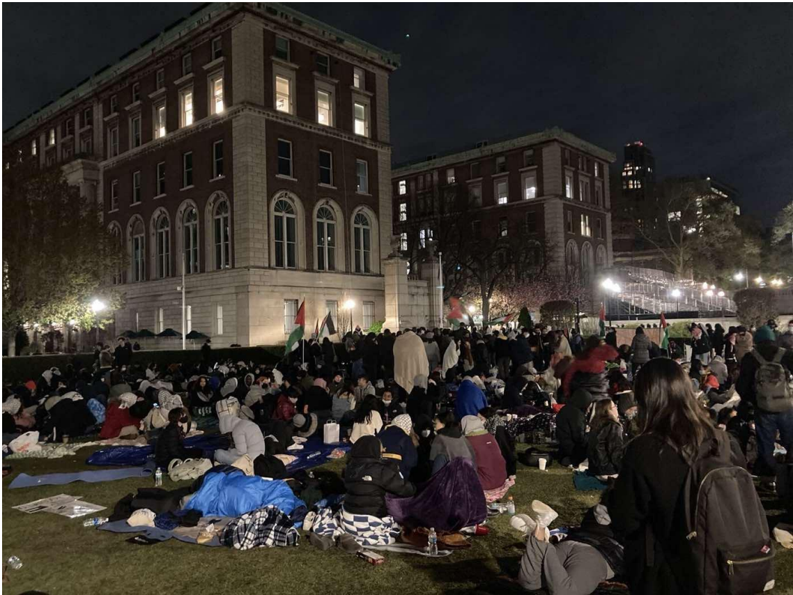
The encampment on the night following April 18.

An hour ago, a breakaway march of fifty or people circled outside the gates; we heard about one arrest. A graduate student from the union wanders from tarp to tarp, canvassing people to gauge how much support there could be for a wildcat strike in different departments. A knot of undergrads discuss the day's events; one rattles off a list of other universities where solidarity encampments are popping up, awe tingling in her voice. It feels like we are collectively stepping through a door into the unknown. Something big, bigger than we can imagine. The university thought it could break our spirit of defiance and crush our experiment with Palestinian solidarity. But today has made it undeniably clear: this is just the beginning.