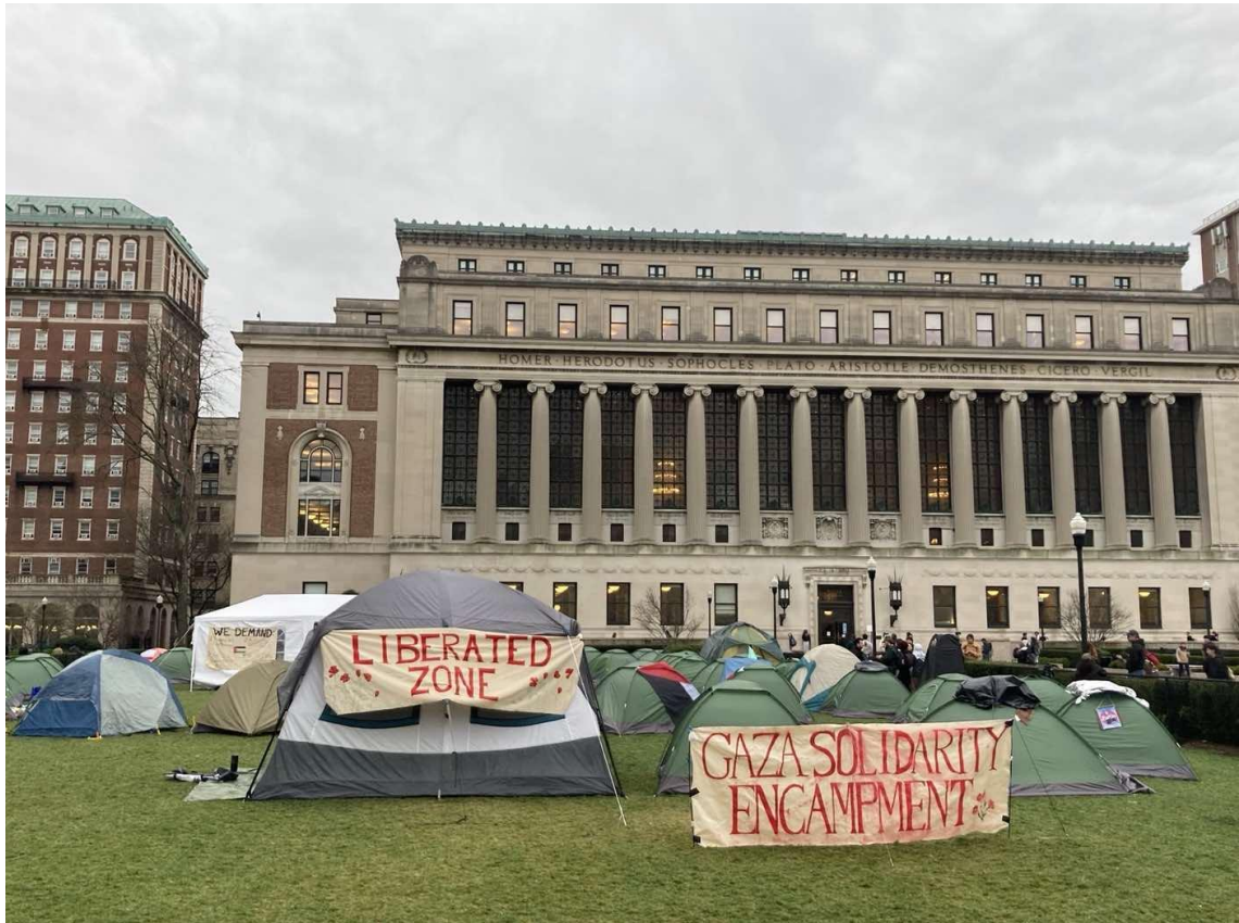
The East Lawn on Columbia University campus on Wednesday, April 17.