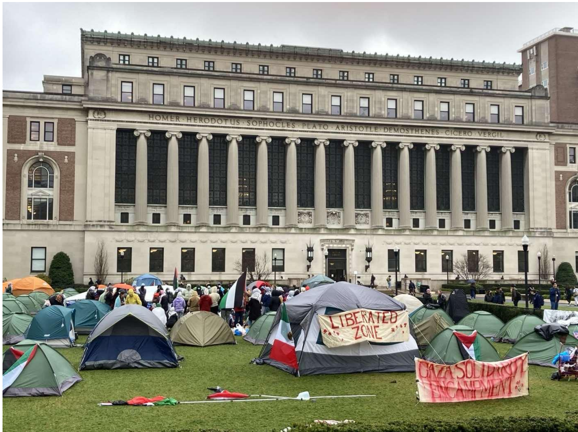
Columbia campus on the morning of Thursday, April 18.

Finally, the immediate reestablishment of an occupied zone successfully leveraged an asymmetry between the protesters and the administration when it came to their vulnerability to negative publicity. The administration had decided to arrest the participants who refused to disperse from the encampment, and the police had prepared to do so. But even though the police had the material capacity to do far worse, neither the administration nor the police were prepared to bear the negative consequences of going further. The students regained the initiative by taking advantage of the fact that the authorities were already risking bad press, which could be magnified exponentially if they overreacted in an unpredictable situation. This turned what could have been a devastating defeat into a pivot that built the movement's momentum.