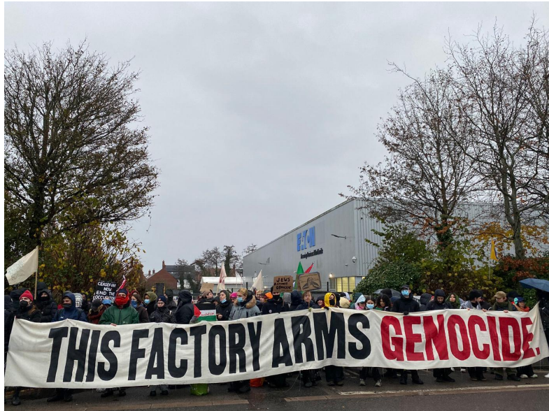
Demonstrators blockading a factory that makes parts for the F-35s that the Israeli military has been using in its assault on Gaza.