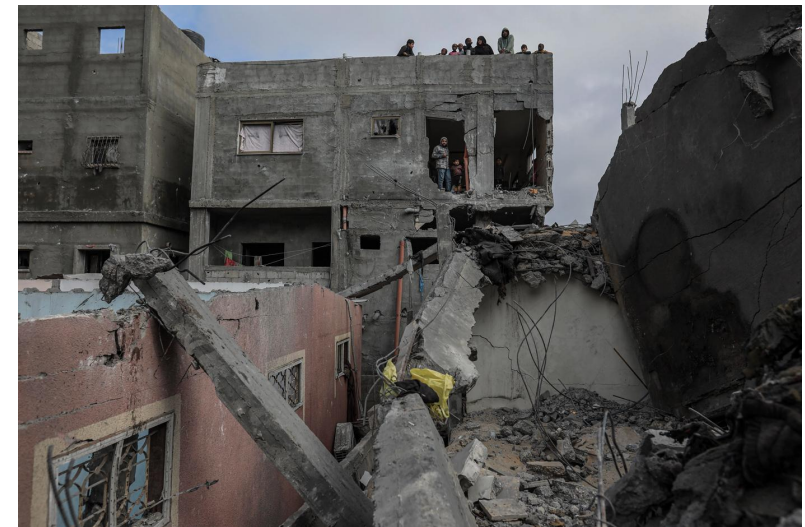
The consequences of an Israeli attack on al-Zawaida refugee camp on February 7, 2023.

This failure passes on the responsibility of forcing an end to the ongoing catastrophe, so that it falls on the shoulders of civil society. This ought to compel us to move beyond the empty liberal paradigms of human rights, which have replaced liberation as the dominant discourse in leftist politics.