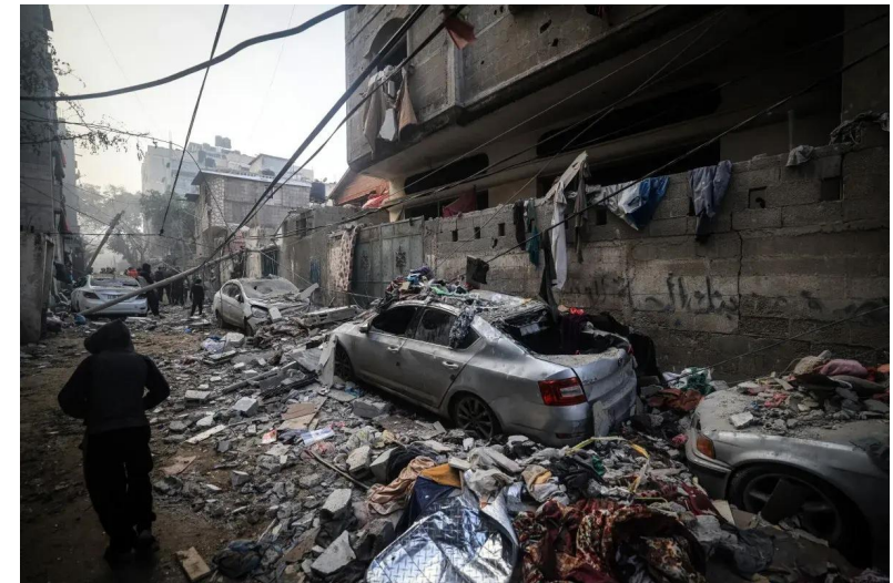
The consequences of Israeli airstrikes on Rafah this week

too vast to be narrated. We are left with faceless anonymous figures. Among them are more than 12,000 children. Probably a lot more.