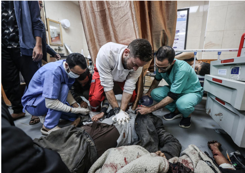
Palestinian doctors desperately attempting to save the lives of Palestinians, including children, injured in an Israeli attack.