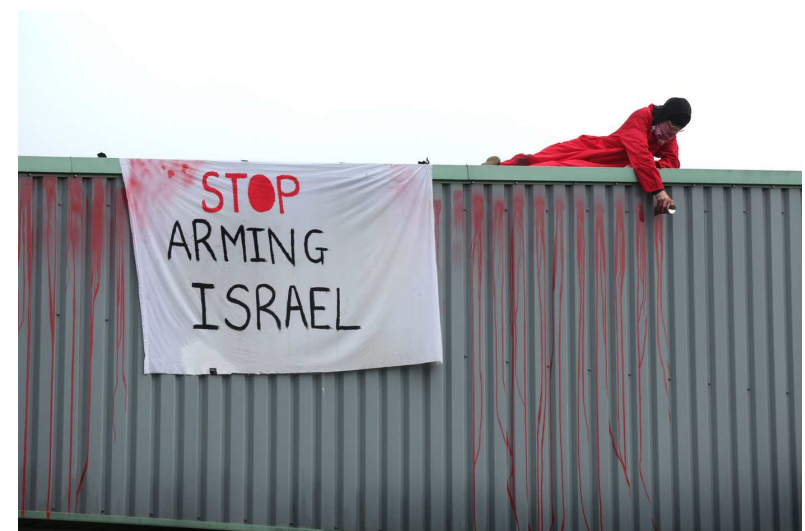
A photograph from Palestine Action showing a protester occupying the roof of Howmet Fastening Systems in Leicester, United Kingdom. 6 Howmet makes components for Israeli F-35s.

Protests for Palestinian liberation have taken place in most major cities in the United States, often with thousands of participants. Many of these protests draw a through-line connecting the struggle for Palestinian liberation with the struggle against United States colonialism. Protesters have highlighted the fact that the United States government is the single largest donor to Israel's military