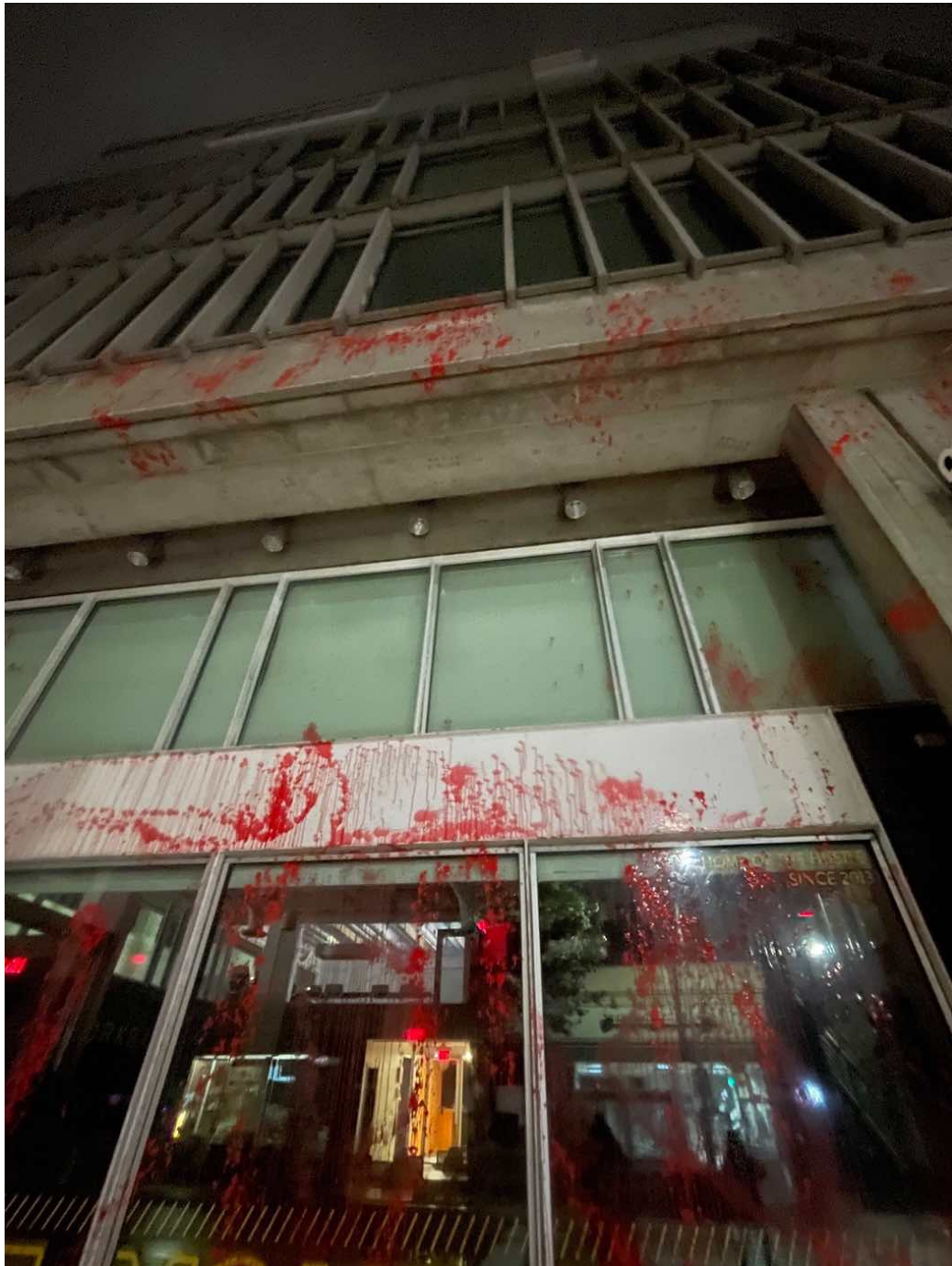
The Cambridge facility of the arms dealer Elbit System sprayed in red paint on October 16, 2023 in solidarity with those suffering in Palestine. 7

Though the number of Jews who have mobilized across the United States over the past four weeks is impressive, neither the demands they have presented nor the devastating civilian death toll in Palestine have swayed the decisions of elected officials.