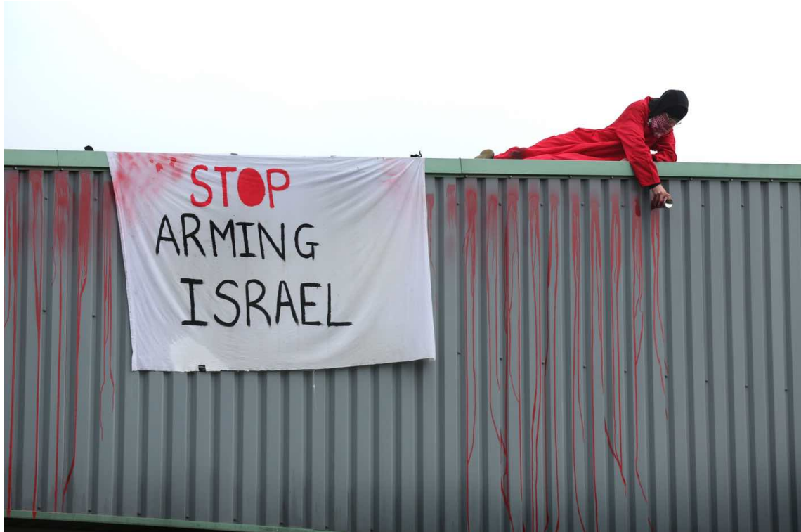
A photograph from Palestine Action showing a protester occupying the roof of Howmet Fastening Systems in Leicester, United Kingdom. 6 Howmet makes components for Israeli F-35s.