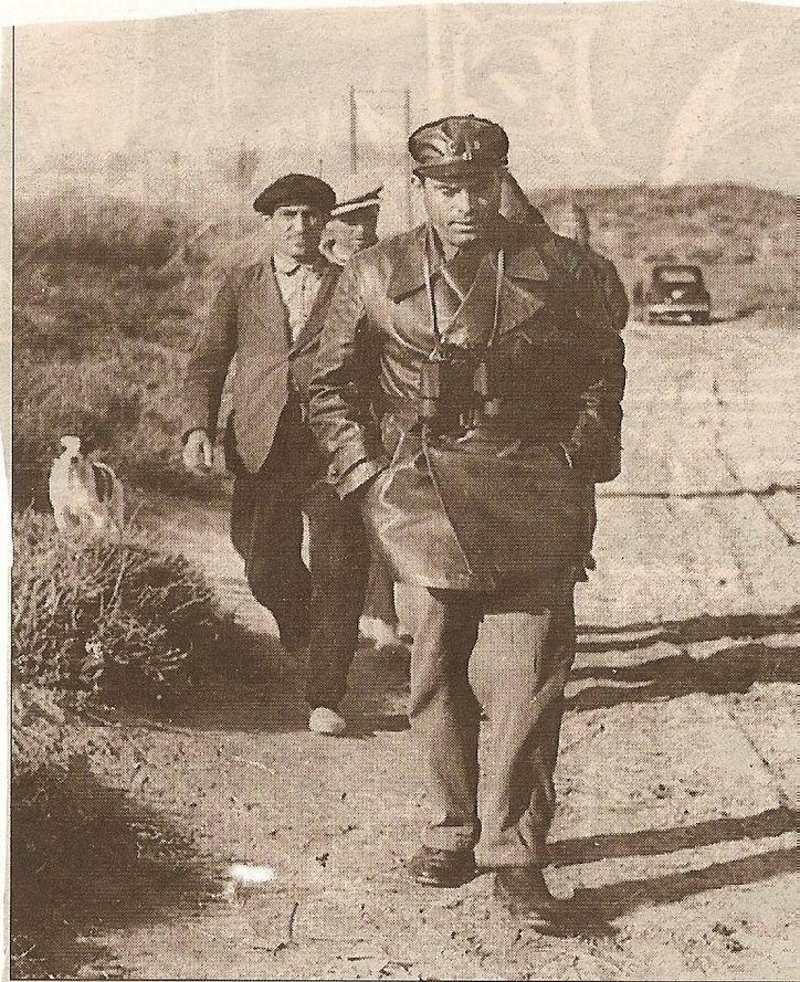
Buenaventura Durruti, en el frente de Aragón.

in our hearts,' he said in a hoarse whisper. And he added: 'That world is growing in this minute.' 1