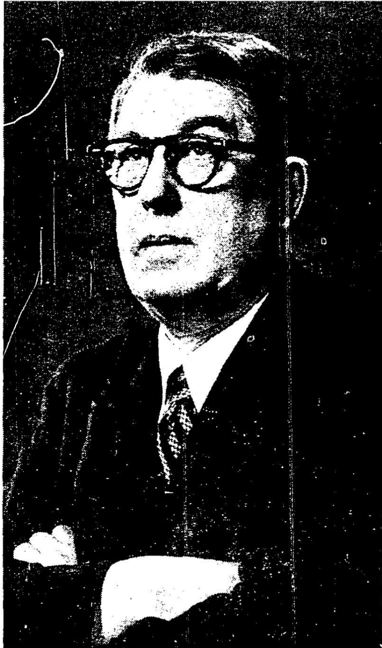
Pierre van Paassen

Van Paassen. Picture from review of To Number Our Days in the Chicago Tribune, 10 May 1964.