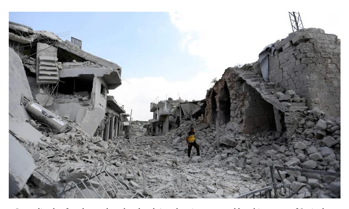
Immediately after the earthquake, the al-Assad regime resumed bombing parts of Syria that remain beyond its control.