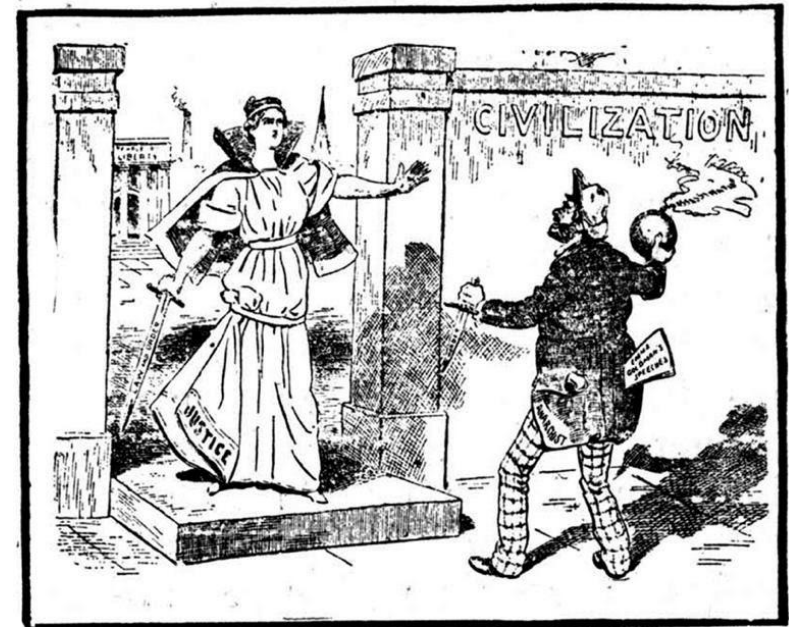
PUT THEM OUT AND KEEP THEM OUT

And if the reader takes nothing else away from this article, at least take this: you are far, far, FAR more likely to find a self-described anarchist at your city’s local chapter of Food Not Bombs, working at your town’s food banks and soup kitchens, organizing unions at crony corporations in your county, or organizing any number of ventures to improve your community than you are to find them out in the streets with a cartoon-ish bomb (or a very real Molotov cocktail) committing acts of violence against innocent people.