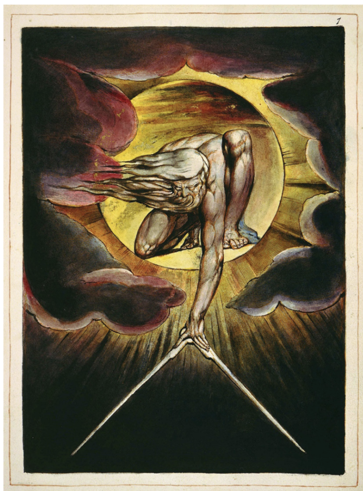
Fig 2. The compass is associated with power (in a geometrically gendered arrangement) by William Blake in Europe: A Prophecy (1794) — ‘When he sets a compass upon the face of the deep’ (Proverbs 8: 27)