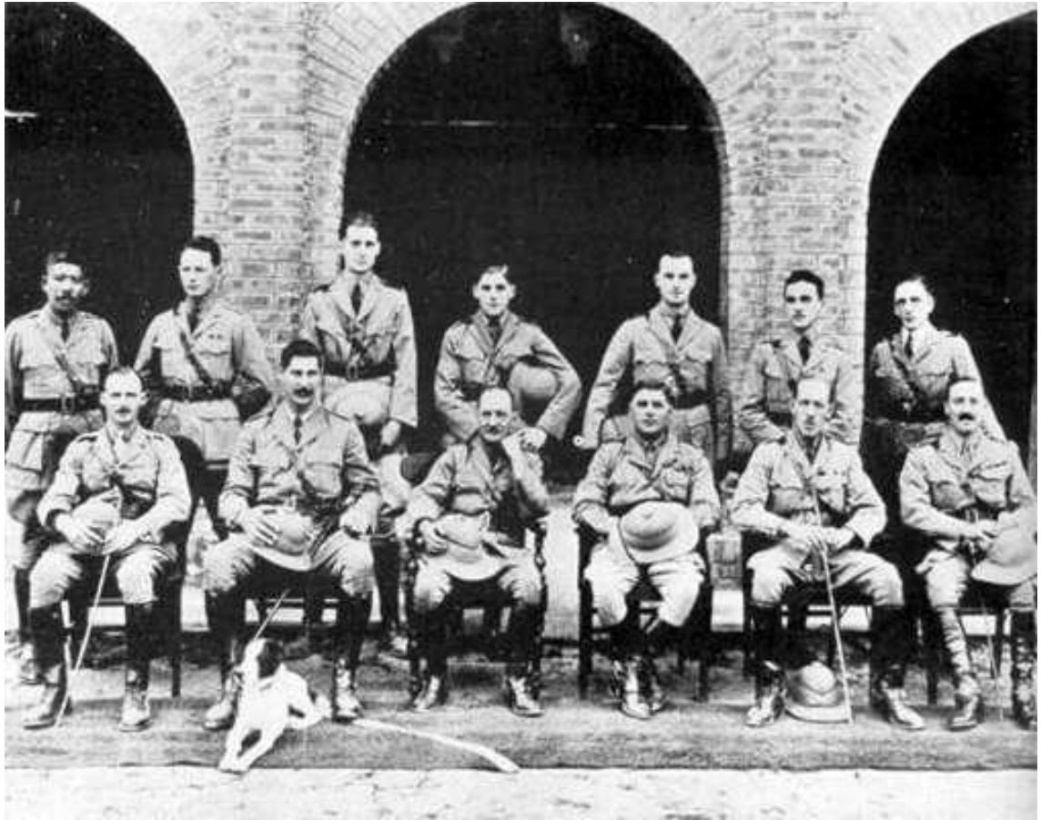
Orwell's police regiment in Burma