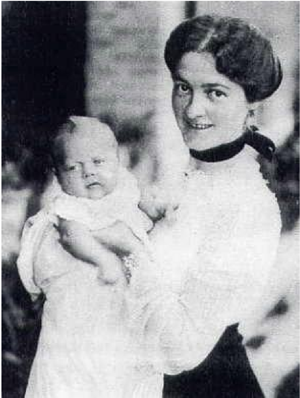
Orwell as a baby