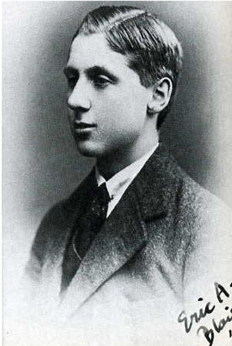
Orwell as a young man