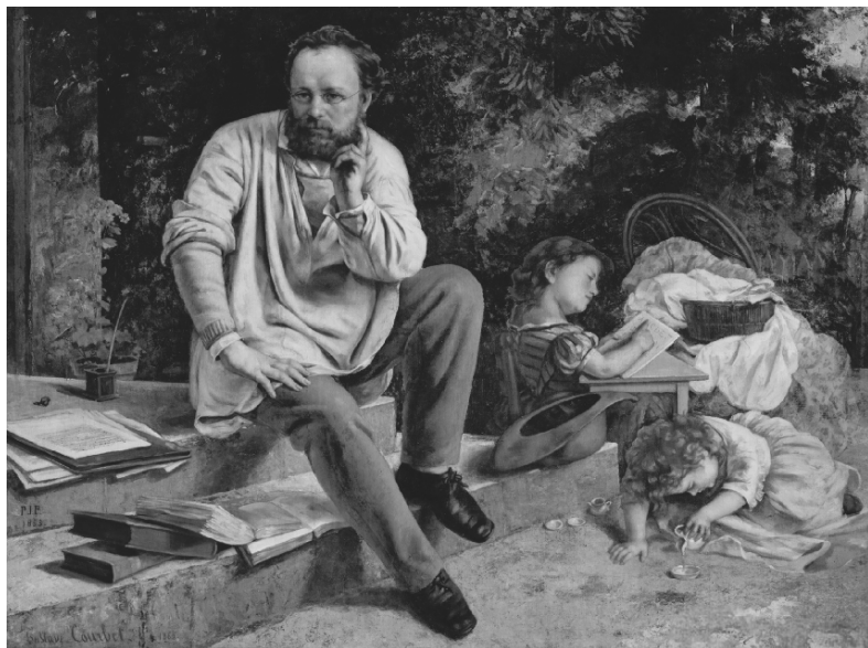
Pierre-Joseph Proudhon and his Children by Gustave Courbet Painting in the Petit Palais, Paris

Bisontin paper L'Impartial . It was a flattering offer, but Proudhon was still too unsure of himself to accept lightheartedly.