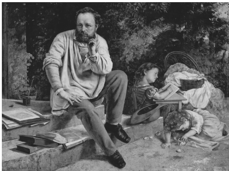
Pierre-Joseph Proudhon and his Children by Gustave Courbet Painting in the Petit Palais, Paris