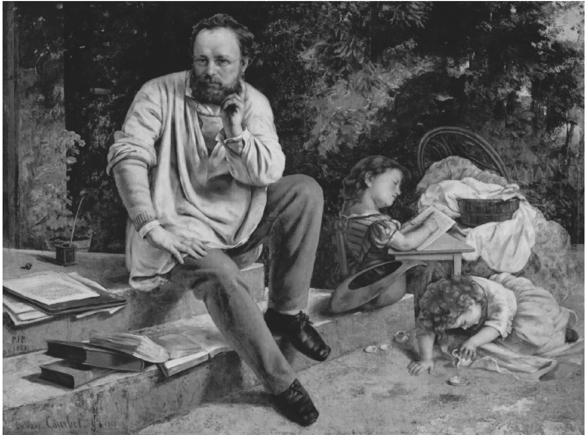
Pierre-Joseph Proudhon and his Children by Gustave Courbet Painting in the Petit Palais, Paris