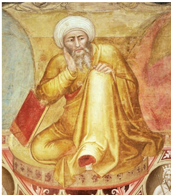
Ibn Rushd (Averroes), depicted by Italian painter Andrea Bonaiuto (1343–1377)