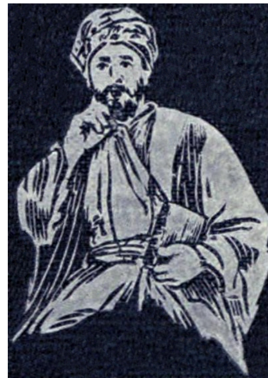
Cover illustration of The Confessions of Al-Ghazali (1909)