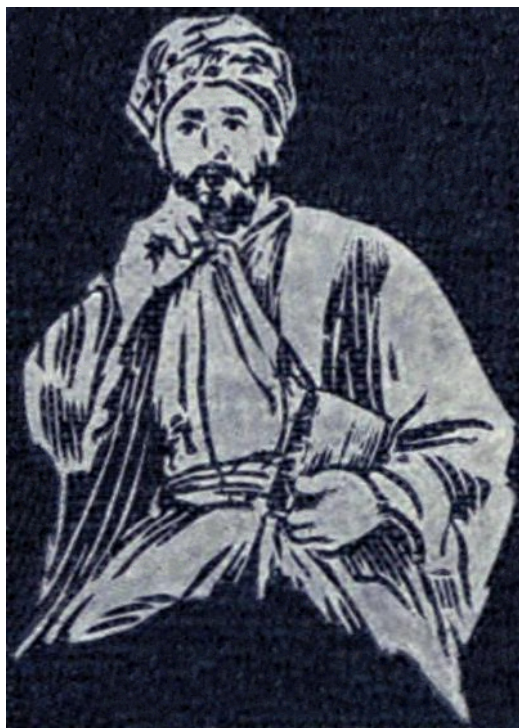
Cover illustration of The Confessions of Al-Ghazali (1909)

post-colonial perspective to critique settler-colonialism, white supremacy, and Western imperialism. There is no question that these are real ills that must be contested, but the post-colonial framing espoused by Abdou crucially overlooks internal authoritarian social dynamics while facilitating the avowal of the orthodoxies he affirms. This problem also extends to South Asia and its diaspora, as Hindu-nationalist sanghis have taken advantage of the naïveté of many Western progressives to normalize Indian Prime Minister Narendra Modi's fascist rule 48 . Still, authoritarian rule does not appear to be Abdou's goal, and his efforts to produce a non-authoritarian vision of Islam are at times noteworthy. A question this review poses is how, in mental and material terms, can adherence to an exclusive doctrine produce an anti-authoritarian world?