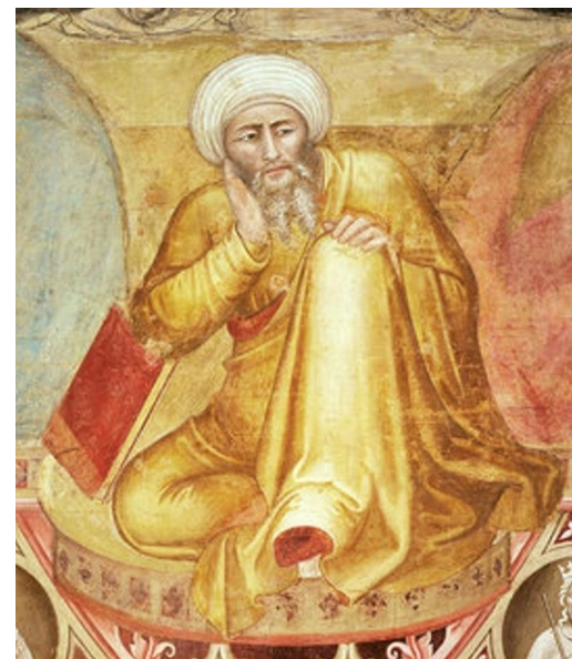
Ibn Rushd (Averroes), depicted by Italian painter Andrea Bonaiuto (1343–1377)