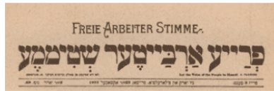
Masthead of the Fraye Arbeter Shtime (the Free Voice of Labor), the longest running Yiddish language anarchist periodical.