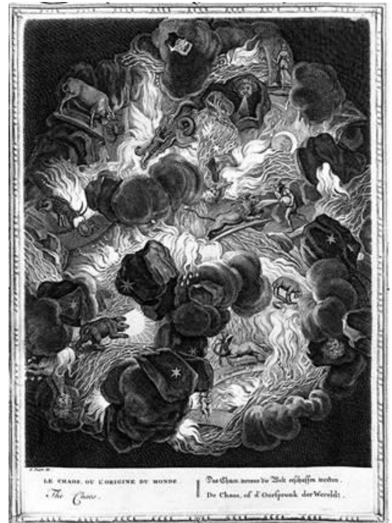
Le Chaos, ou l'Origine du Monde, The Temple of Muses Bernard Picart, (1673–1733)