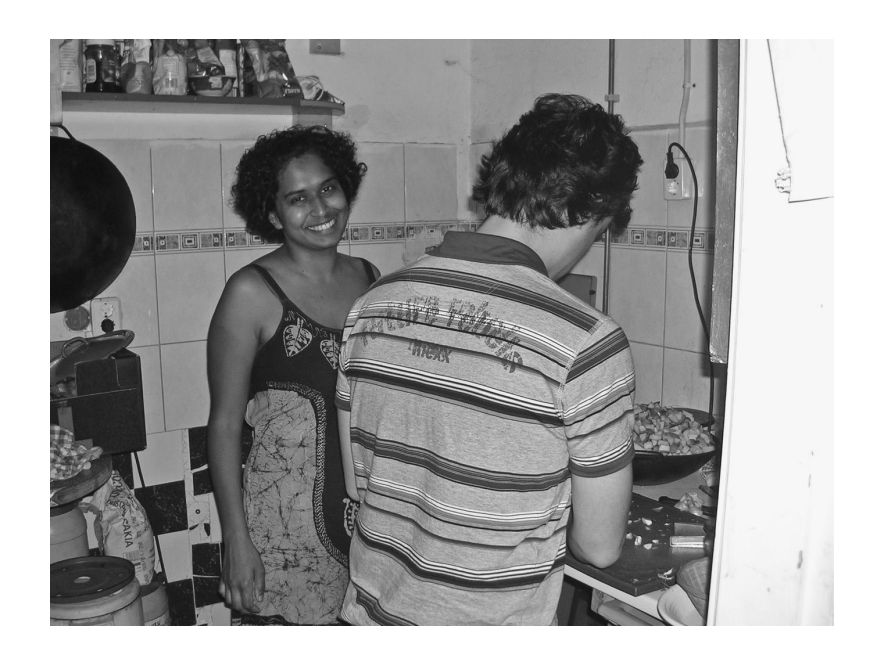
0.3 The author cooking in a squatted restaurant, 2006

Regarding building skills, the squatting movement's ideology is "Do-It-Yourself" implying that everyone has the capacity to learn these skills and that plenty of people will teach those willing to