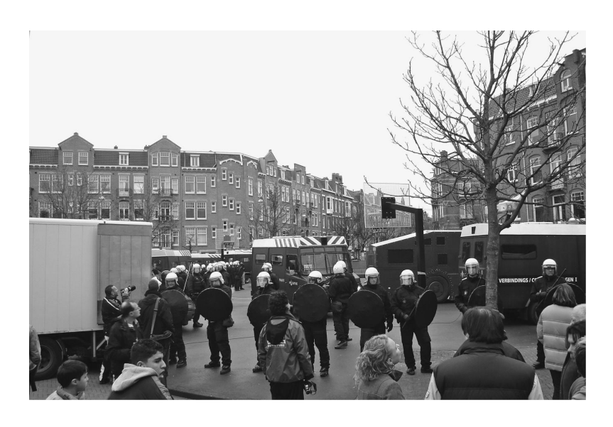
1.3 Eviction of a squat in Amsterdam, 2008

history of violent repression of protests or where the state is a liberal, Western European democracy, but the protesters are less privileged citizens, such as members of minority groups. The literature assumes the structural locations of these activists – which is highly educated, middle-class, privileged, white, and often European or American but never explicitly speaks to these conjectures and how the authorities' response to protesters differs vastly if they were not assumed to be privileged whites (take, for example, the civil unrest in Paris suburbs created by working-class Muslim immigrant youth in 2005, to which the French state reacted by brutally policing the residents of these neighborhoods).