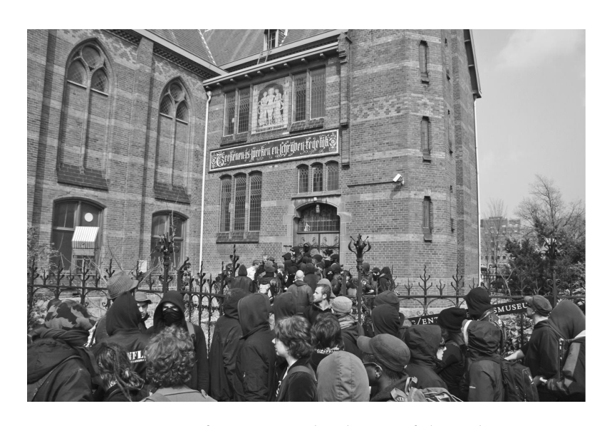
4.1 The squatting of Drawing School, part of the Rijksmuseum, 2008

while guests live off their labor parasitically. It is also common for guests to simply never leave unless the living group forces them out, which proves uncomfortable for everyone involved.