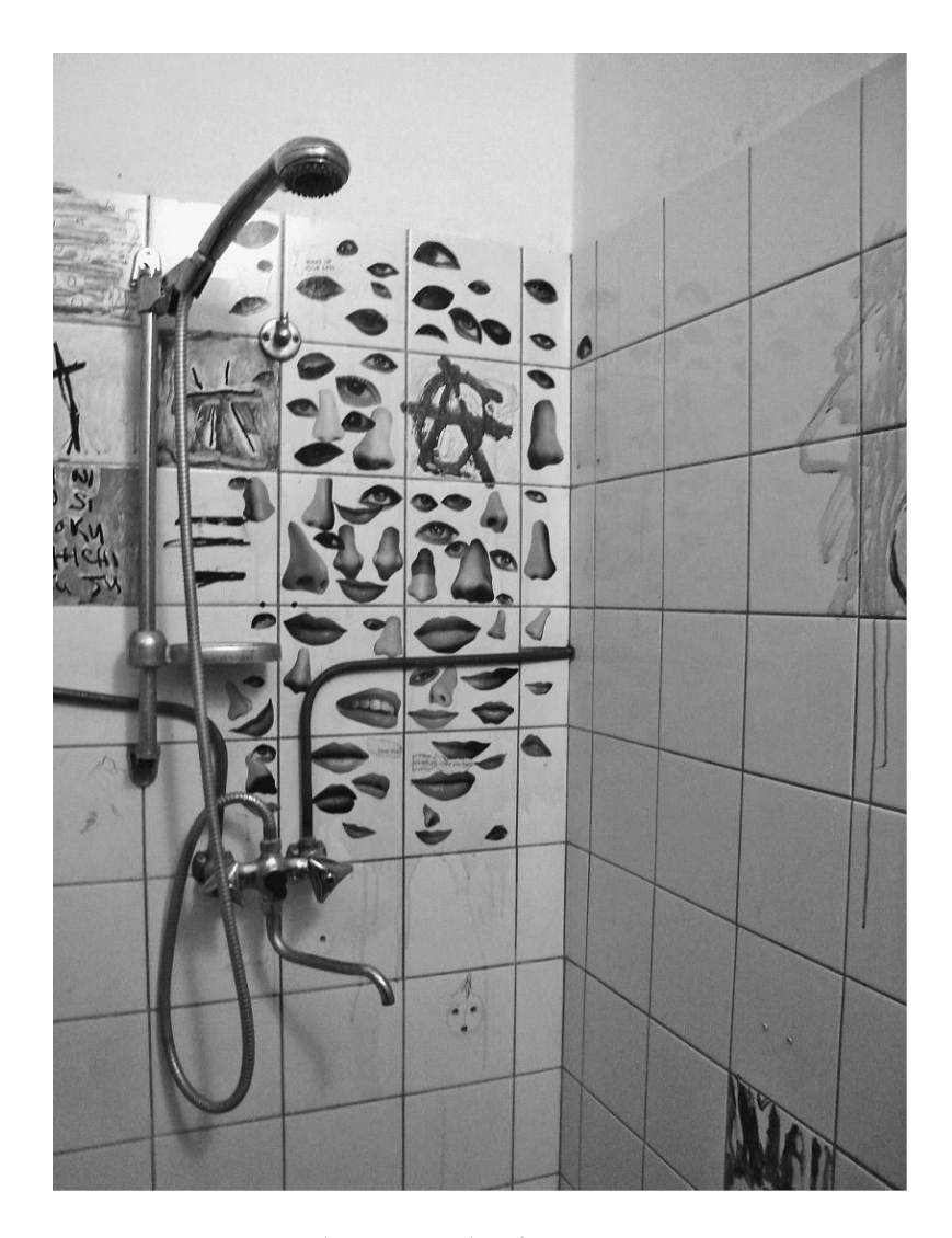
3.1 Shower inside of a squat, 2006

Tall, blond, blue-eyed, and broad-shouldered Fleur was raised on a houseboat in a sailing community in north Holland – a member of the, as she calls it, "respectable working class." Although at the time of writing, houseboats are fashionable in the Netherlands, when Fleur was a child, houseboats connoted "trailer trash" with its own community-based subculture. She grew up in a tight-knit, social democratic family in which both her parents worked as captains of tourist boats. Fleur disavows anarchism and proudly