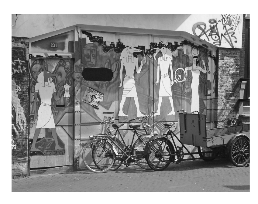
2.1 A squat on the Spuistraat in the center of Amsterdam, 2006

violent. The police perform "uber-toughness" in this interaction as well. They sport new gadgets, enormous trucks, and align themselves in military formation, with shields, weapons, and helmets. Each eviction wave costs thousands of euros for the city.