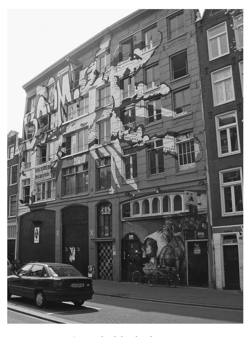
0.1 The Vrankrijk legalized squat, 2006

policy and the presidency of Ronald Reagan. The women's movement manifested in the squatters' subculture through a number of squats that banned the presence of men, to the point that during alarms, they permitted men to stand in front of the house but did not allow them to enter the squat to defend it from eviction.