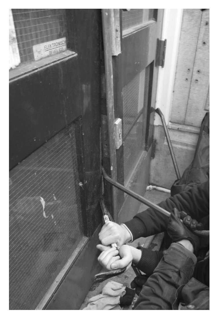
1.1 Breaking open a door during a squatting action, 2008

movement in Amsterdam. Communal living groups within squatted households both reflect and refract larger movement dynamics of hierarchy and authority. They reflect larger movement standards in the sense that one's squatter capital contributes to one's status position within a squatted household. They refract in that within a household, the highest values are to maintain a lively and peaceful group dynamic, silently maintain the unspoken hierarchies within a group without challenging them, and to avoid tension and conflict.