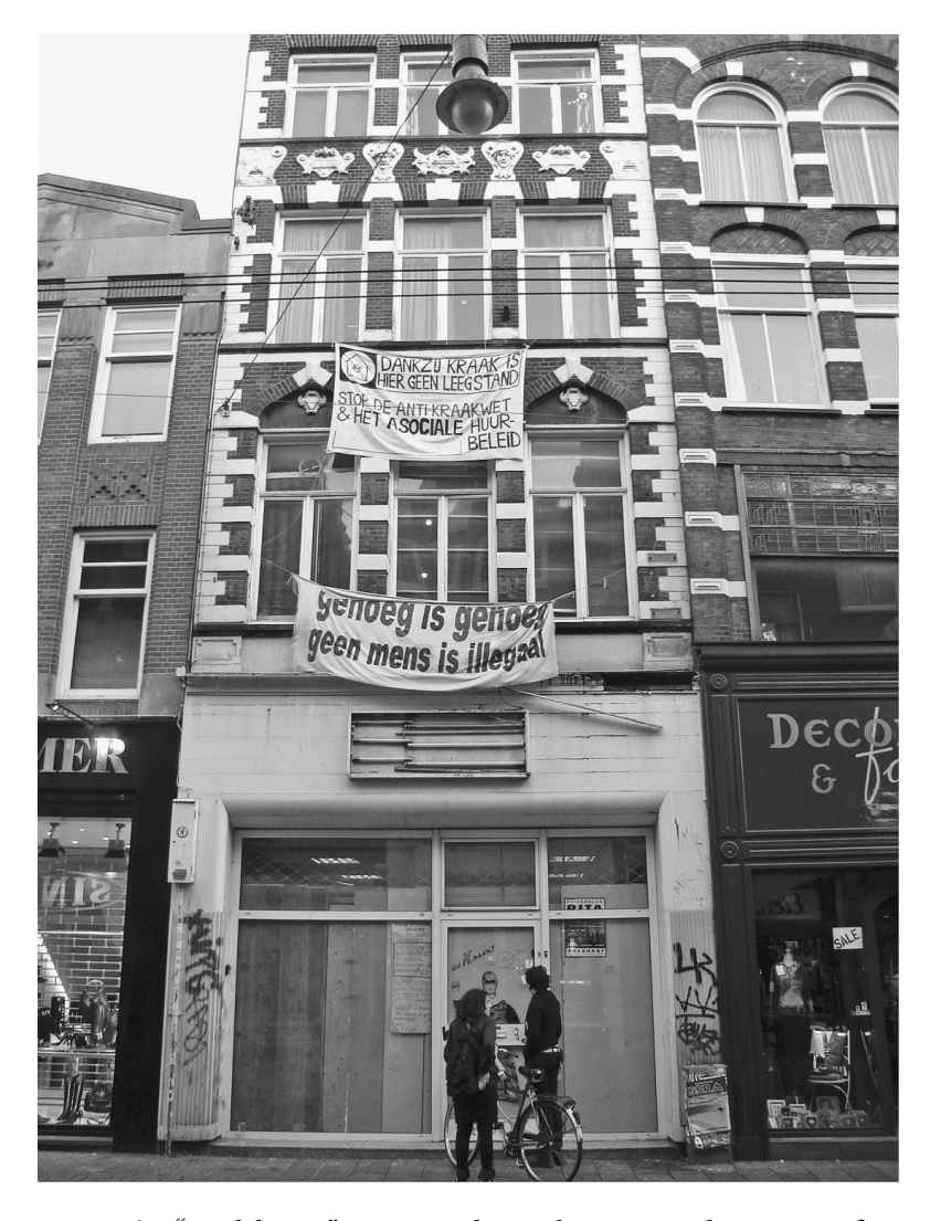
3.2 The "Leidsbezet," a squatted social center in the center of Amsterdam, 2006

A few ethnographies of subcultures offer insight by charting the careers of subcultural participants. Fox (1987), in her ethnographic research on punks in the American Midwest in the 1970s and 1980s, found that punks hierarchically organized themselves into subgroups according to the intensity of individual commitment to the punk counterculture and their performance of a punk fashion and lifestyle. With more intense commitment, the more exclusive the subgroup becomes. Hardcore punks consist of participants who demonstrated the strongest devotion to the punk lifestyle and value system and who possessed the highest status. Softcore punks were less devoted than the hardcores to the oppositional punk lifestyle and had relatively less status than hardcore punks. However, the hardcore punks considered the softcore's involvement as sufficient and generally viewed them as transitioning towards hardcores. The preppie punks, who Fox characterizes