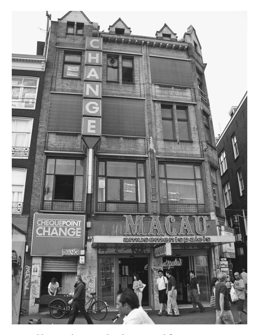
3.4 Building on the Damrak, where ground floor space was in use commercially while upper floors were squatted, 2006

Squatted houses present a convergence of the public and private in a dramatic way. On one level, these houses are private spaces, where ideally a resident should feel comfortable in a convivial and warm living group, which provides a safe haven from urban alienation via an alternative to the nuclear family. However, they are also public spaces in that they both constitute and are produced by a social movement. Hence, movement capital of individual residents impacts the micro-social dynamics of the group. Further,