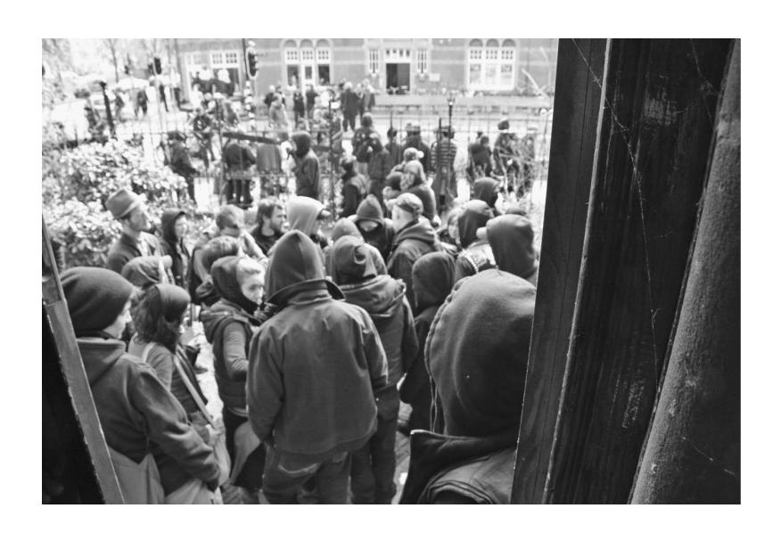
i. Squatting Action Amsterdam, 2008

interviews with squatters, they often expressed a heavy nostalgia concerning a mythical heyday. In the 1970s, they referred to the late '60s; in the late 1970s, the early '70s. In 1981, they extolled 1980 as the moment of authentic activism, and in the mid-80s, the early 1980s was the high point. By the 1990s, this sentiment became "the '80s," a mythmaking discourse which continues up to the present.