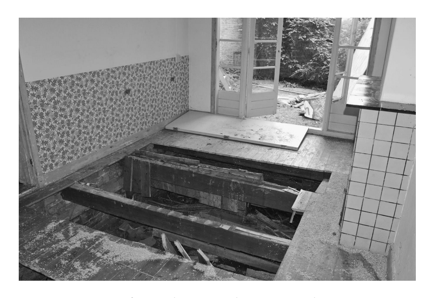
4.2 Interior of a newly squatted apartment that requires rebuilding floors, Amsterdam, 2009

autonomous life is a fiction, a narrative on the movement's front and back stages that masks a deeper collective yearning for belonging and love through the performance of a non-conformist, anti-capitalist, individualist self. This fraught ideal is impossible to achieve and requires a constant disavowal and double-speak.