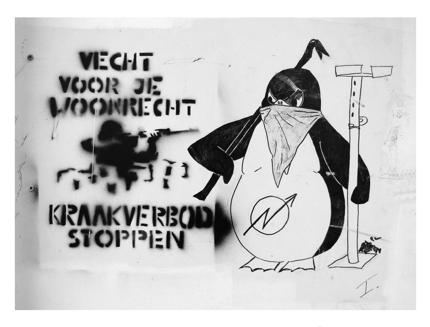
0.2 Graffiti against the squatting ban circa 2006: "Fight for your housing rights. Stop the squatting ban"

taken over the street, and say, repeatedly: "Fucking Muslims. Fucking Muslims."