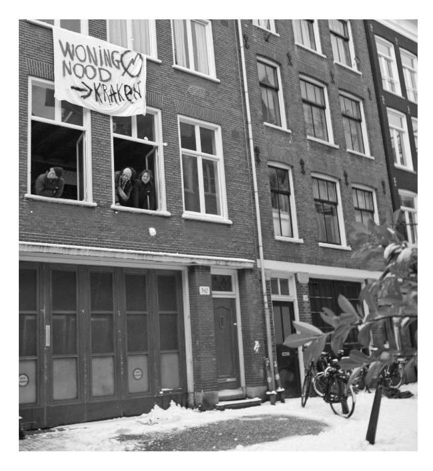
2.4 Banner outside of squat that states: Housing shortage \rightarrow Squat

The following is a compilation of gossip that I have heard about Dominic from a number of women. To be clear, I cannot confirm