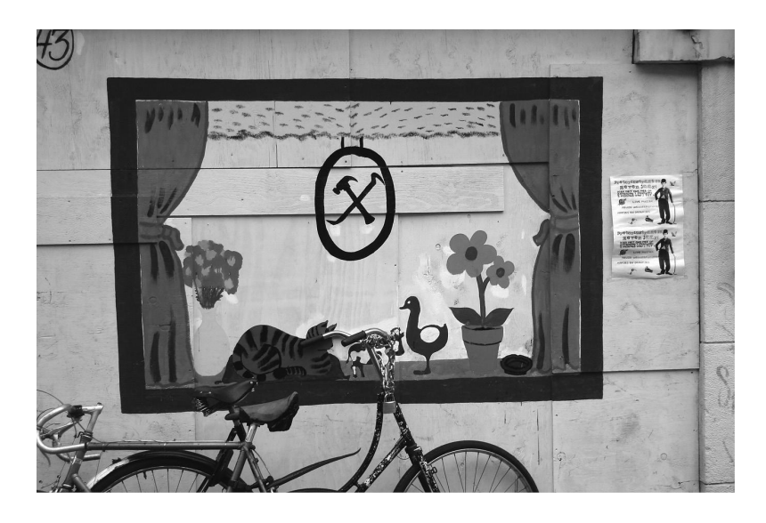
4.3 The painted exterior of a squat, 2008

As in the case of Karima, or anyone who does not fit into the two extremes of squatter personhood – the culturally central activist versus the culturally marginal participant – the need for material and bodily security renders a squatter unable to reach a state of autonomy. Examples include the single mother juggling a low-income job, benefits, and raising her children, while illegally subletting an apartment that costs more than her total income; or the undocumented refugee who fled a war zone, has been rejected by the Dutch refugee machinery, and lives in the margins of Amsterdam. They can be tolerated within the community but not treated as equals within the framework of squatter capital and standards for being recognized as autonomous. If one is afraid of the police, lacks interest in participating in violent actions and going to jail, finds barricading and occupying time-consuming and stressful, or feels intimidated by the barrage of paperwork, owners, and