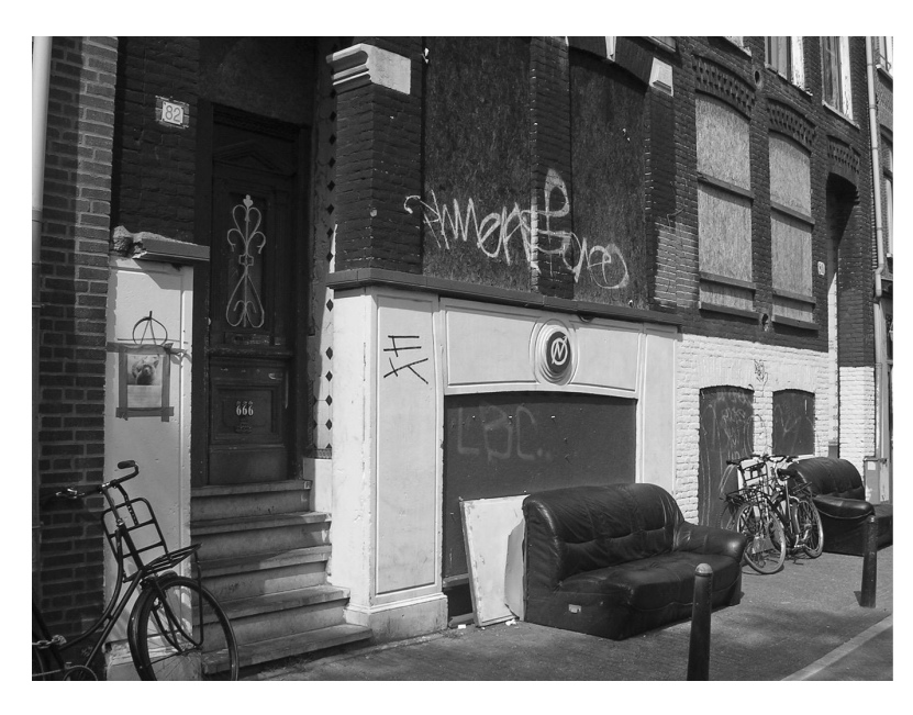
2.2 Squatted building alongside a canal in the Jordaan neighborhood, 2006