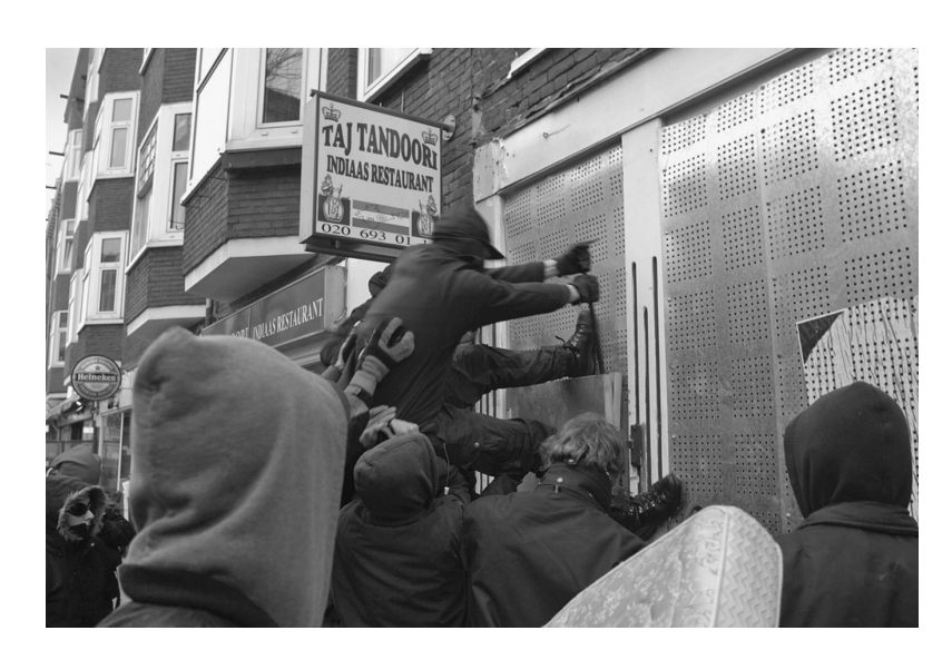
1.2 Breaking open the door during a squatting action

Chapter 1), I realized after a few months that the cost of squatting had outweighed the benefits and moved to rental accommodation to finish my dissertation.