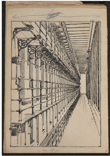
Figure 2. Berkman's Sketch of Penitentiary Cells

Note: Alexander Berkman, "Drawings and Prints of the Penitentiary and of an Advertisement for the 'Union Broom' Made by the Prisoners" n.d.