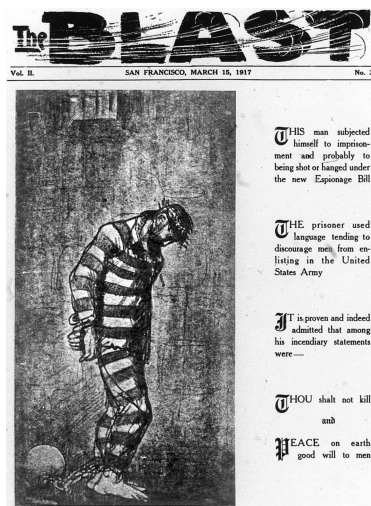
Figure 3. Cover of The Blast , March 15, 1917

earth good will to men.” The man in ball, chains, and stripes bears a crown of thorns—again, Christian imagery idolizes the political prisoner but ignores the prison or other prisoners. The short run of The Blast focused on the legal persecution facing Billings and Mooney, Margaret Sanger, Goldman, the Magón brothers, and Carlo Tresca, its pages peppered with advertisements for the Prison Memoirs yet with little about incarceration itself.