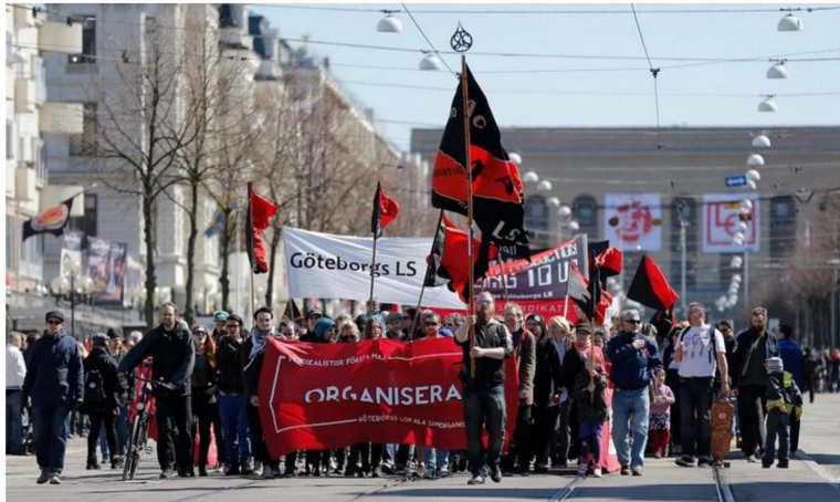
SAC Demonstration in Gothenburg 2013.