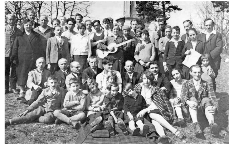
Fig 6: Excursion of the Singer’s Circle “Freedom” of the B.h.S. near Graz, 1929.