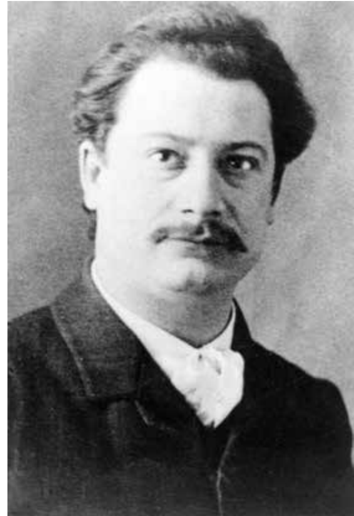
Fig 4: Pierre Ramus, aka Rudolf Großman.