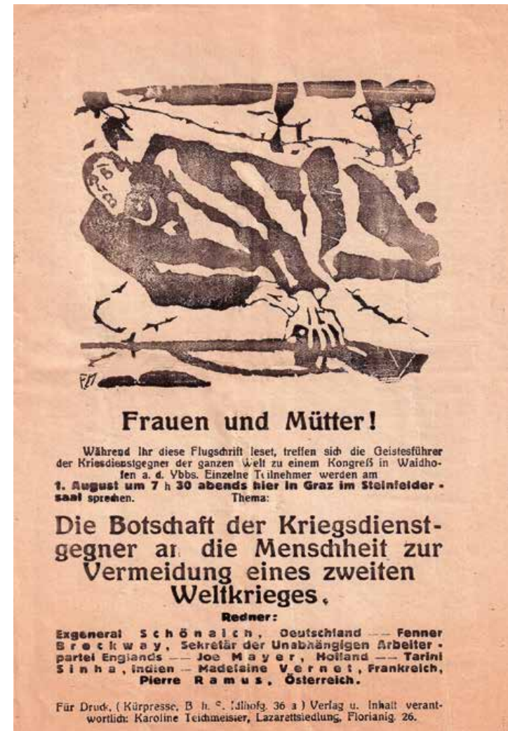
Fig 10: Invitation of the B.h.S. and the League of War Service Resistors to a demo against war in Graz on August 1, 1928 with speakers who took part in the conference of “War Resistors International” in the Lower-Austrian town of Sonntagsberg. Front side of the flyer. Graz, 1928.