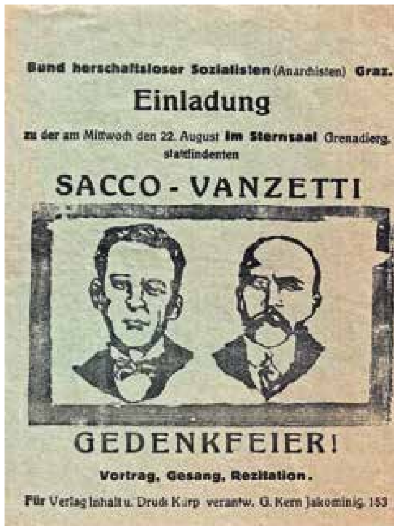
Fig 13: Invitation to a memorial by the B.h.S. Graz on August 22, 1928, for the one year anniversary of the judicial murder of the American anarchists Niccola Sacco (1891–1927) and Bartolomeo Vanzetti (1888–1927). Graz, 1928.