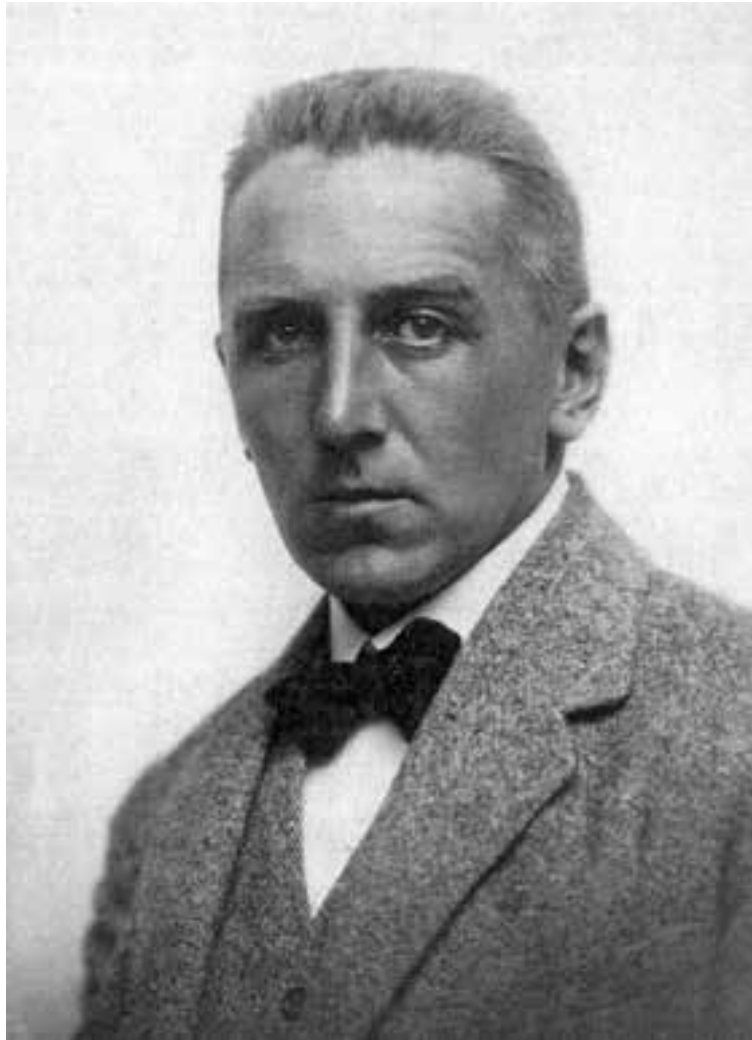
Fig 12: Herbert Müller-Guttenbrunn. Graz, circa 1925