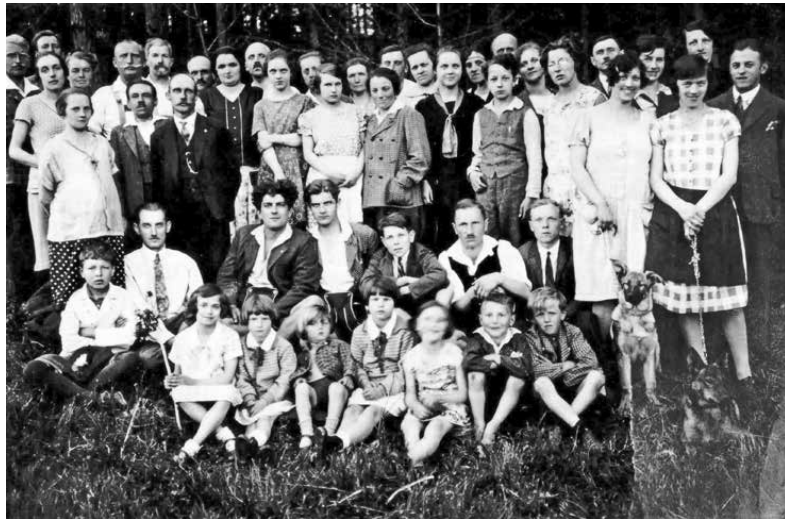
Fig 17: Excursion of members of the former B.h.S. in the Graz surroundings. Circa 1934..

Movement” in Graz. Nothing clarifies this more than the fact that police in 1912 tallied only a bit more than 50 anarchists in the entire province of Styria. 9