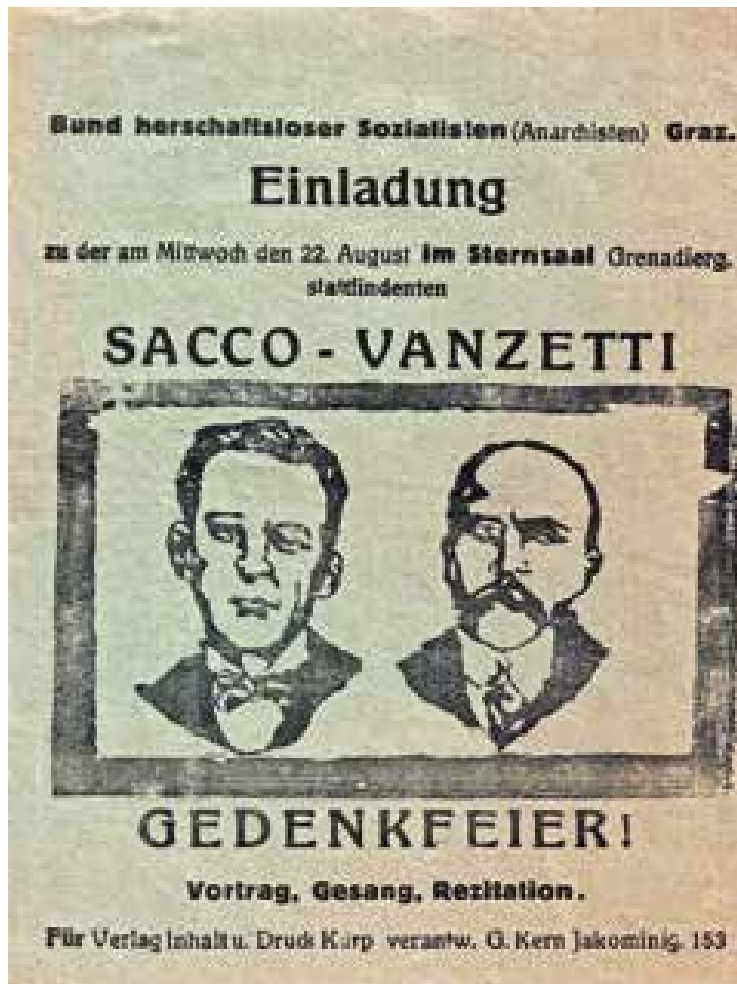
Fig 13: Invitation to a memorial by the B.h.S. Graz on August 22, 1928, for the one year anniversary of the judicial murder of the American anarchists Niccola Sacco (1891–1927) and Bartolomeo Vanzetti (1888–1927). Graz, 1928.