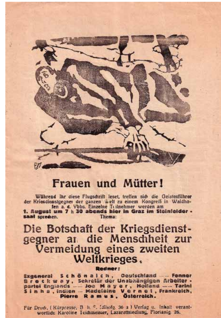
Fig 10: Invitation of the B.h.S. and the League of War Service Resisters to a demo against war in Graz on August 1, 1928 with speakers who took part in the conference of “War Resisters International” in the Lower-Austrian town of Sonntagsberg. Front side of the flyer. Graz, 1928.