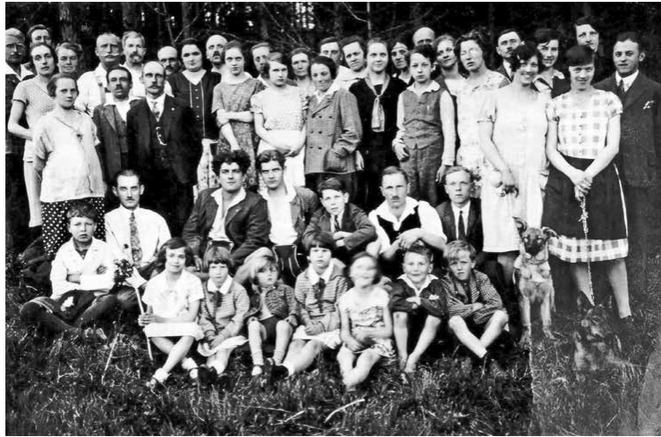
Fig 17: Excursion of members of the former B.h.S. in the Graz surroundings. Circa 1934.

Buchdrucker von Graz). Certainly it would be an exaggeration to speak of an “Anarchist Movement” in Graz. Nothing clarifies this more than the fact that police in 1912 tallied only a bit more than 50 anarchists in the entire province of Styria. 9