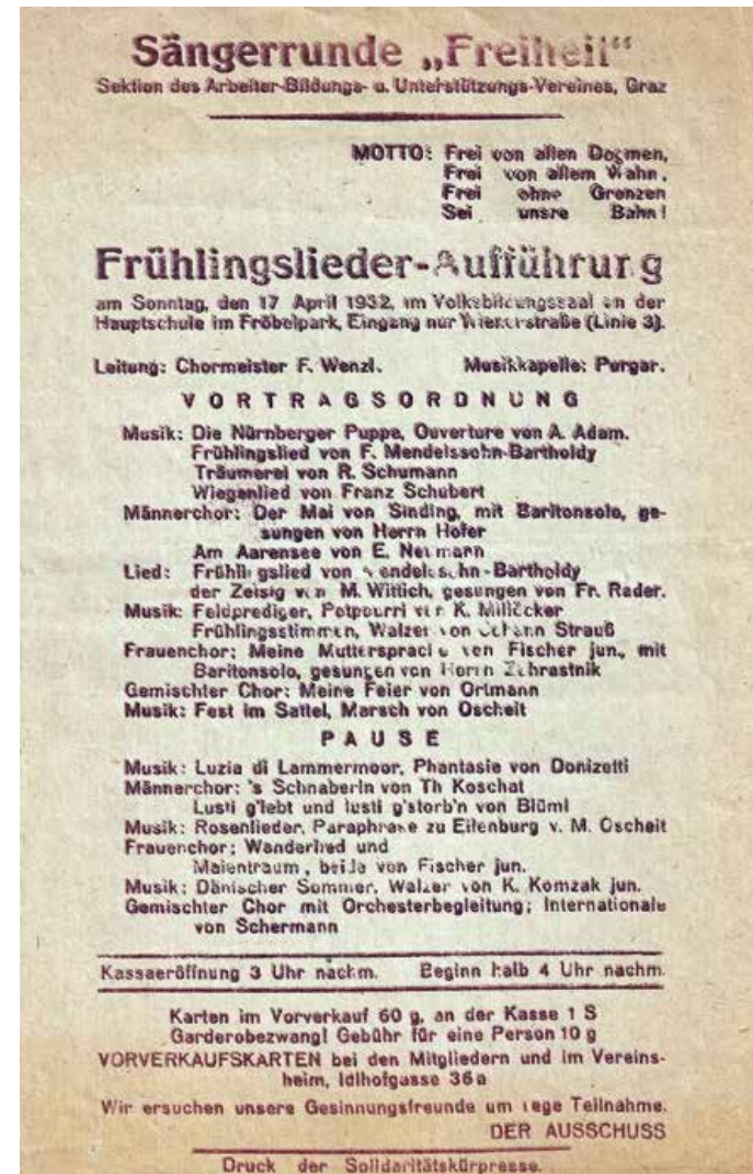
Fig 7: Invitation of the "Singer Circle Freedom" of the B.h.S. to a "Spring Concert" in Graz on April 17, 1932. Graz, 1932.