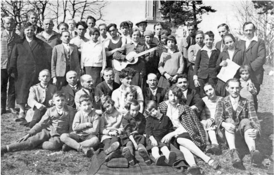
Fig 6: Excursion of the Singer's Circle "Freedom" of the B.h.S. near Graz, 1929.