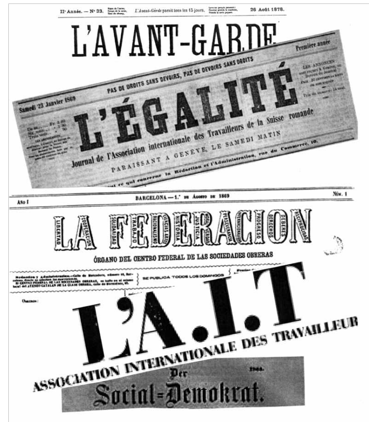
Mastheads of journals from IWA organisations in France, Spain and Switzerland, and from German Social-Democrats