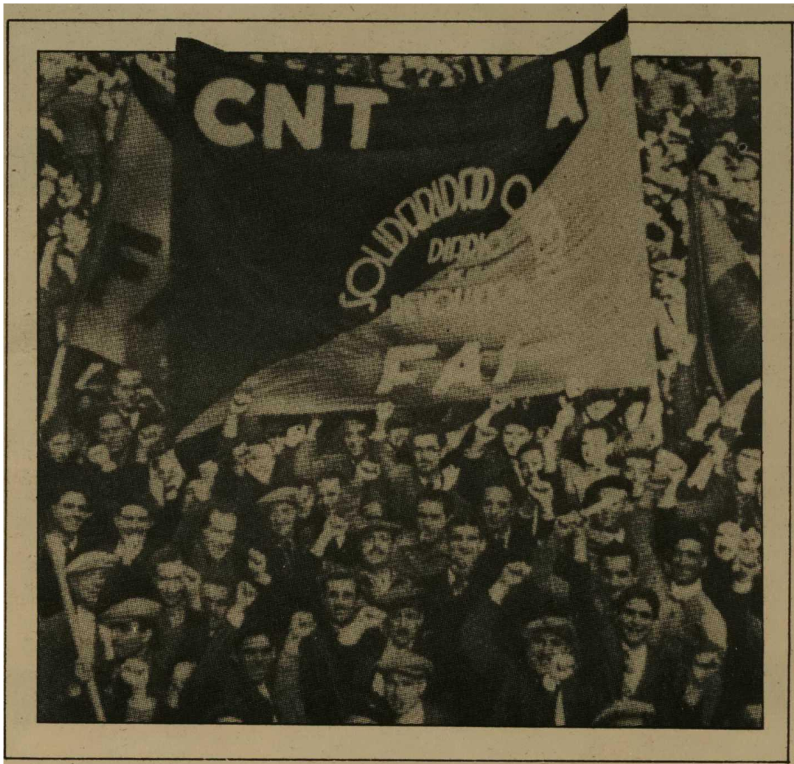
Mass rally of anarcho-syndicalist CNT during Spanish Revolution.