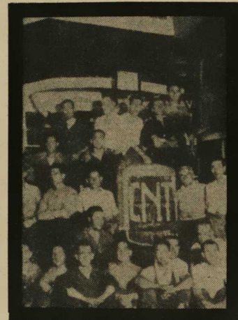
Bus in Spain's collectivised transport system