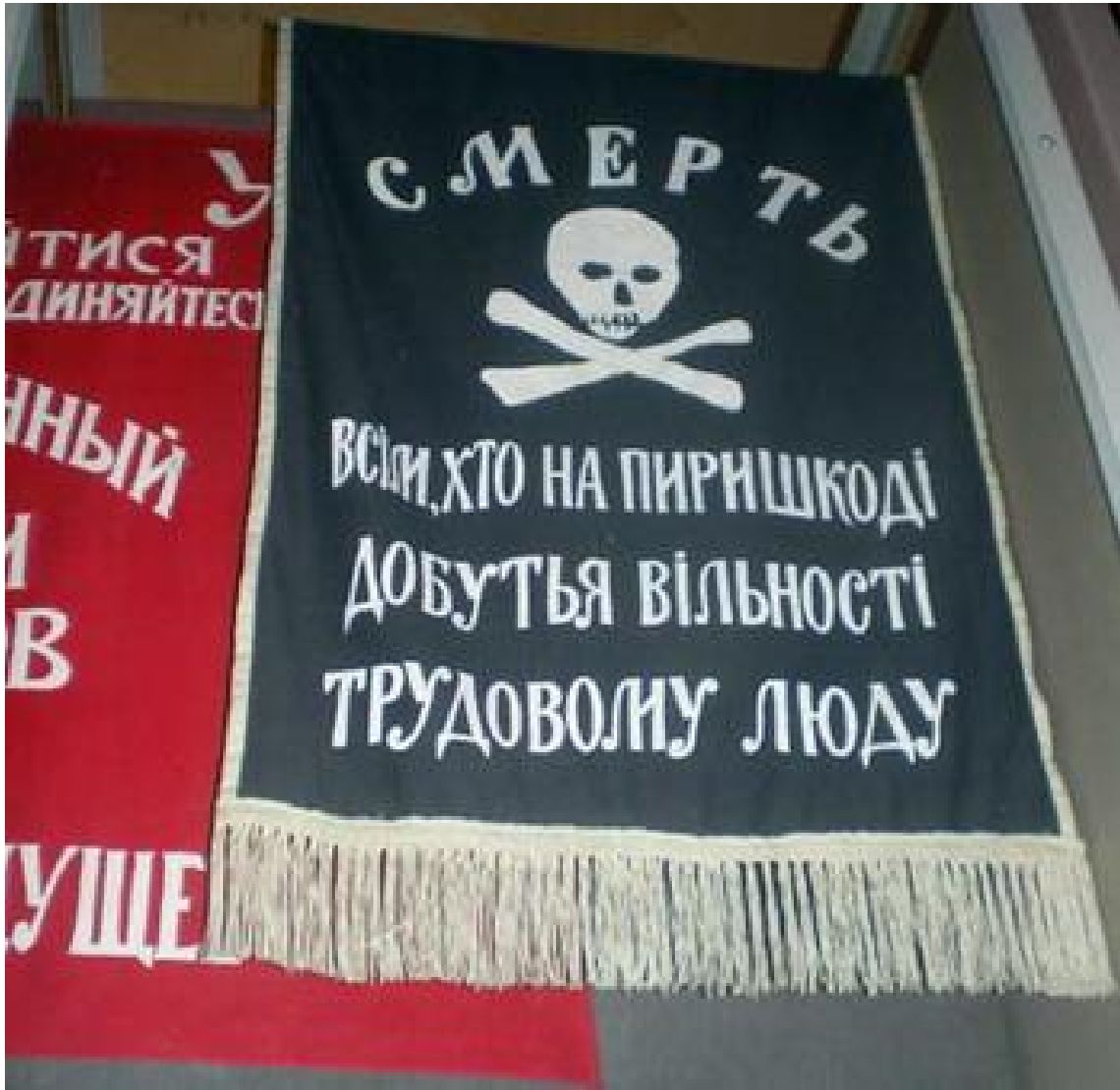
“Death to All ...” replica flag in the Makhno exhibit room at the Huliaipole Local History Museum