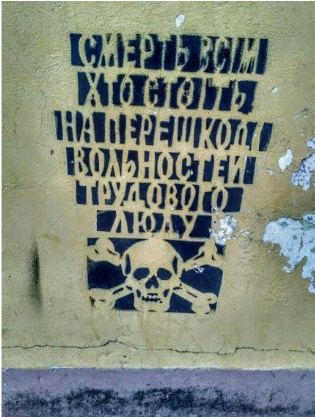
Ukrainian street graffiti