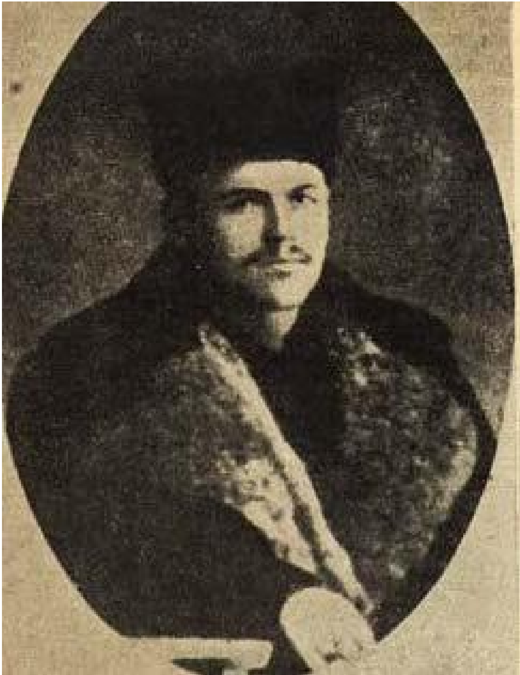
Ostrovskii "false" Makhno photo