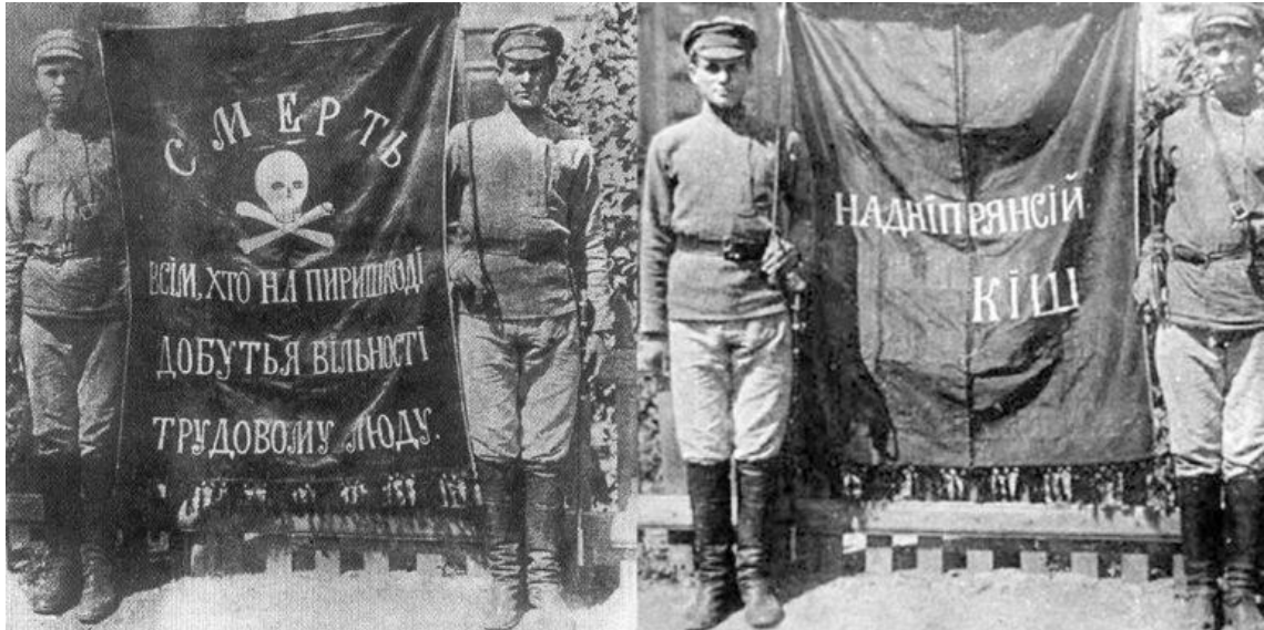
Reverse side of banner (right hand image)

prove Makhno's claim. Moreover, the photo's official entry in the Ukrainian archives lists it as "Banner of the Makhnovists. 1920". 22