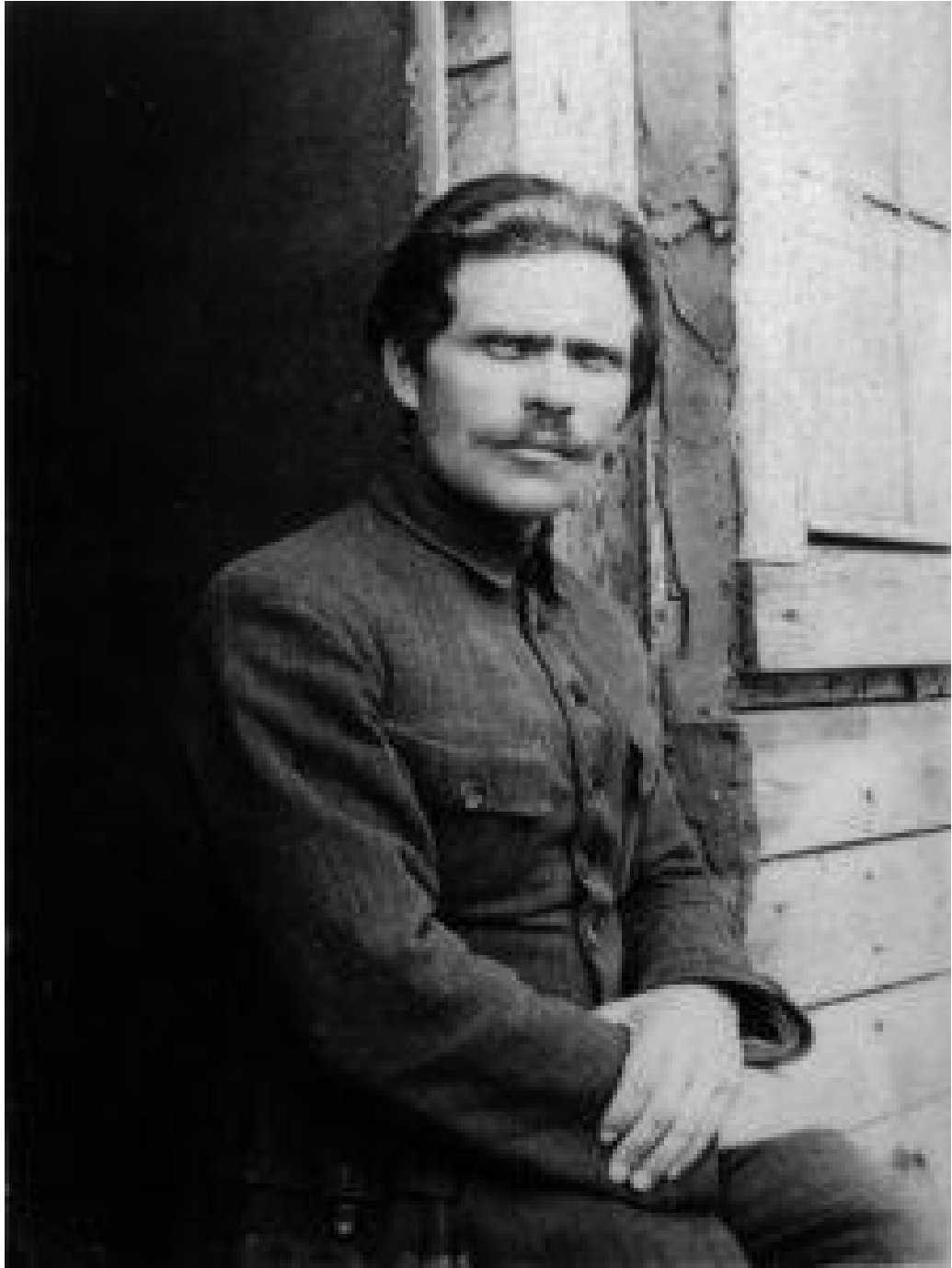
Nestor Makhno, 1921