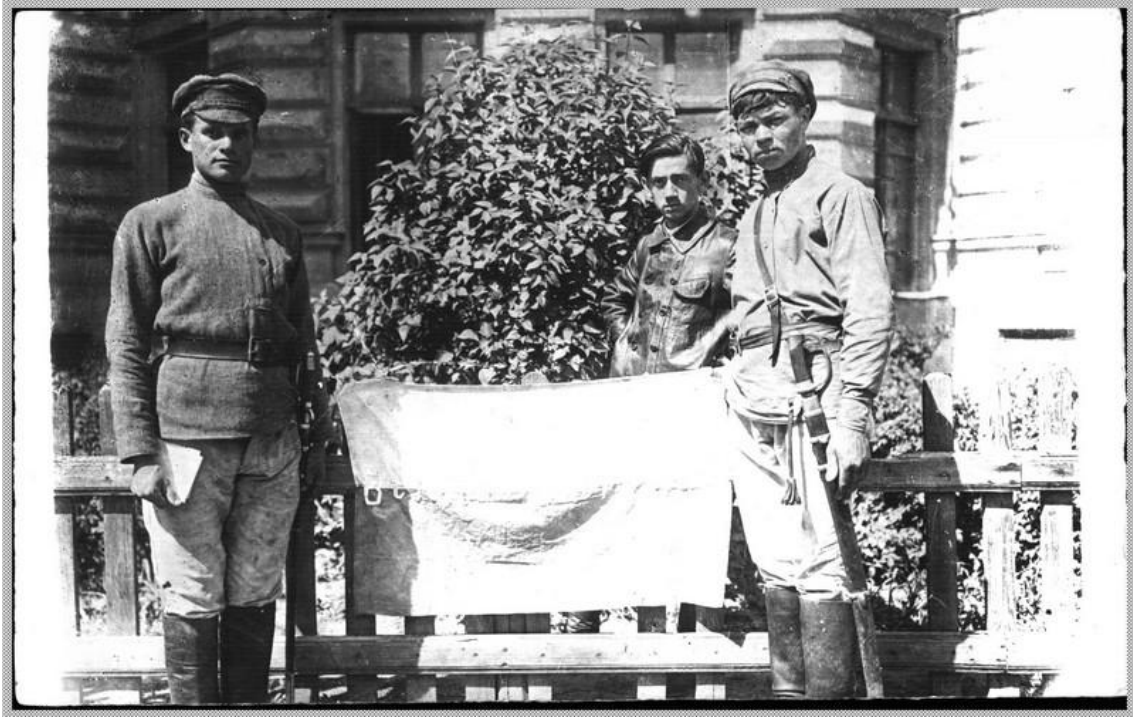
Red Army soldiers with a captured flag of the 1 st Cavalry Cossack regiment “Free Ukraine”

suggesting the flag was specifically associated with Svyryd Kotsur’s brother Petro. 33 In fact, the supposed photo of Makhno produced by Ostrovskii, which Makhno irritatedly rejected, bears a striking resemblance to Petro Kotsur.