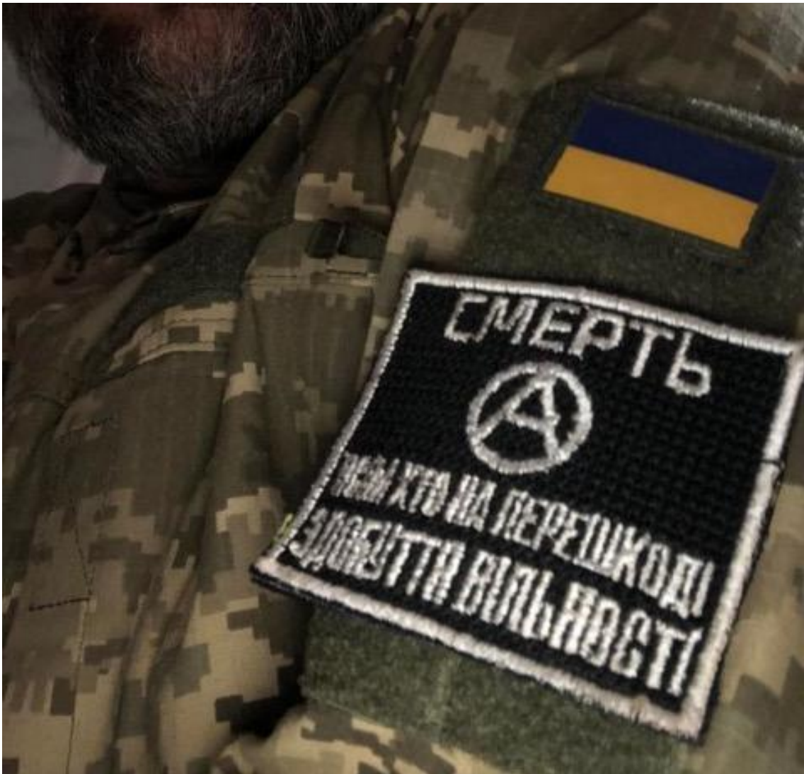
Ukrainian soldier with “Death to All Who Stand in the Way of Freedom” patch

Through this dizzying labyrinth of Civil War regiments, archival entries, and Bolshevik propaganda, an enduring myth was produced. To what extent do its origins matter? Does the fact that this beloved Makhnovist symbol of freedom and popular resistance is not Makhnovist after all diminish its contemporary power on the frontlines or rupture its established chain of meaning? Will the Reddit memes of a Chad Makhno behind the skull-and-bones flag fall into disrepute? These are questions that only the communities that actively engage the flag and its slogan can ultimately answer. However, I suspect the flag will remain a vibrant part of anarchist and Ukrainian symbology.