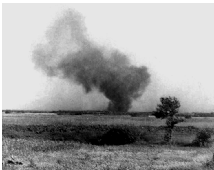
Burning Treblinka perimeter during the prisoner uprising, in August 1943. This clandestine photograph was taken by Franciszek Żabecki.

This ongoing promise of futurity kept many inmates docile in a system that ultimately produced only two things — German wealth and corpses. While the shattering of Lager -time was seemingly the first step to resistance, such a rupture did not necessarily carry insurgent possibilities. For many, the abandonment of futurity simply meant despondency; many souls were broken when the illusion of Lager -time was peeled back to reveal an assembly line of death. For countless inmates, the alternative to futurity was the suicidal allure of the electric fence, which offered an immediate escape from the horror of despondency. Others experienced a complete disintegration of the mind and body. Such living-dead creatures, those whose hearts still beat but for whom death was a foregone conclusion, even had a name within the camps: Muselman . 23 While the Nazis actively fostered a myth of futurity through work and obedience, they simultaneously created the conditions of hopelessness, which for some was akin to death.